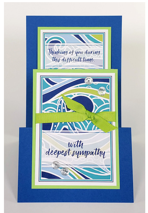
Inside: "Thinking of you during this difficult time."