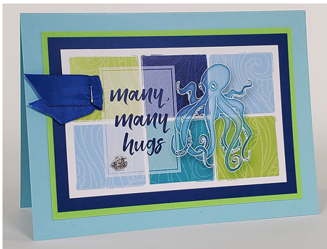
Inside: "Thanks so much!"