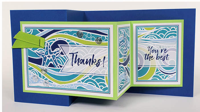
Inside: "You're the best."