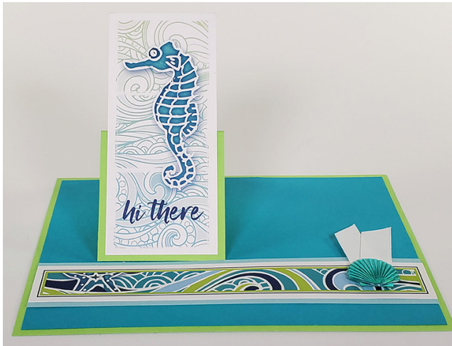
Inside: "Thinking of you."

Notes for all cards: Adhere the 1" tab of the 2¼x5¾" Lime strip onto the back of the Aqua panel, about 1" from the left edge. Center the Aqua panel onto the Lime card base. Adhere a cutapart to the bottom scored area of the 2¼x4¾" area of the Lime strip. Nest a narrow cutapart onto the 1¼x6¾" Lt. Blue strip. Fold a piece of white ribbon in half and staple to the right edge of the strip. Adhere the strip to the Aqua panel, about ½" from the bottom edge. Use a foam adhesive circle to attach a shell sequin over the staple. Add the inner sentiment to the card behind the Lime panel. Tent the card for display, and flatten for mailing.