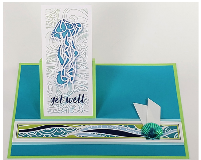
Inside: "Hope you feel better soon."