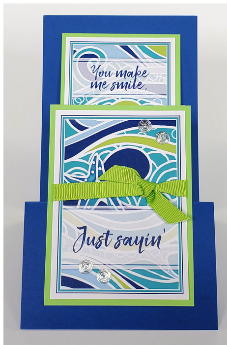
Inside: "You make me smile."