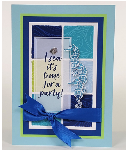
Inside: "Happy Birthday"

Score and fold each 6¼x9" Lt. Blue card base horizontally at 4½".