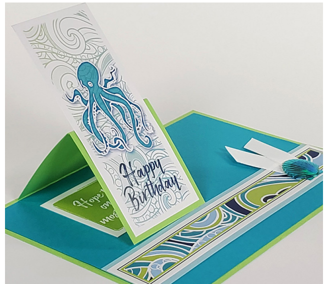
Inside: "Hope this one is most special."