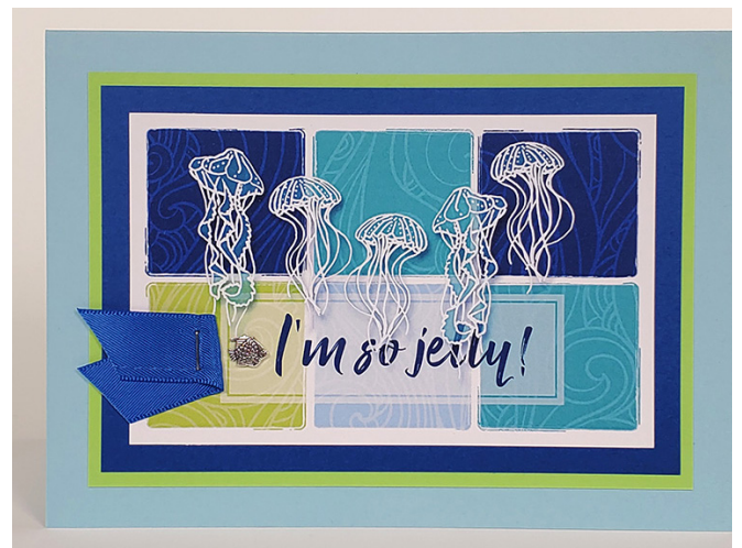
Inside: "Congratulations! So happy for you."

Notes for cards above: Staple a piece of folded blue ribbon to the left edge of the cutapart. Nest the cutapart onto the Dk. Blue and Lime panels and center onto the card base. Glue the mini silver fish charm to the cutapart.