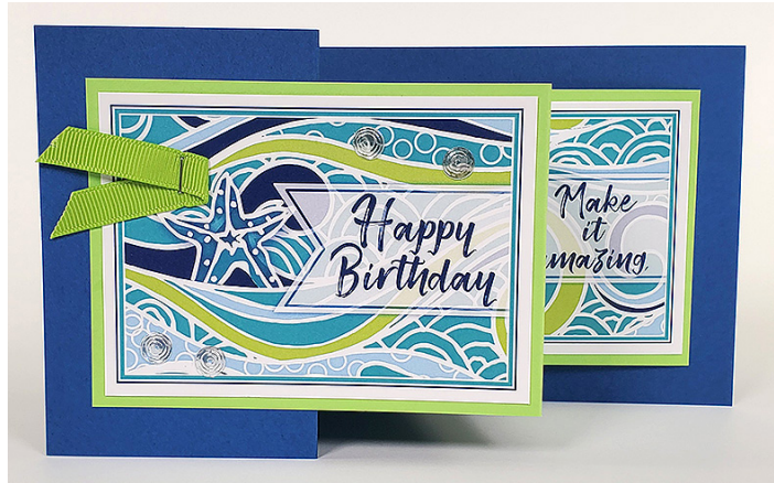
Inside: "Make it amazing."

Score and accordion fold each 3¼x10" Lime Panel horizontally at 4½, 7 and 9½".