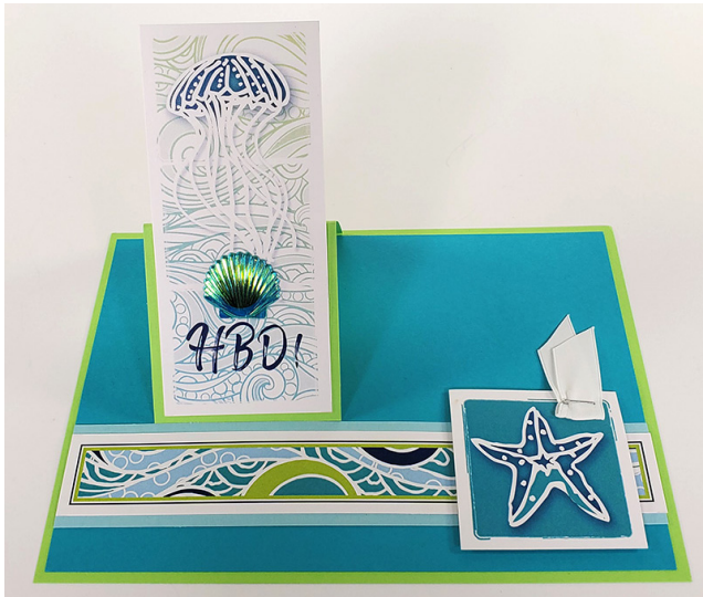
Inside: "Enjoy your big day!"