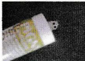
A. Cut Nozzle