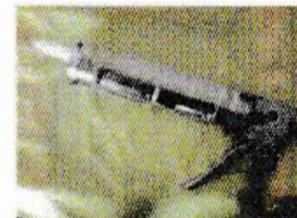
D. Load Caulking Gun

Use on parapets, ledges, windows, beams, patio covers, conduit, walls, barns, pipes, under tiles, roofs, under HVAC units, holes, under roof line and lights.