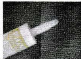
C. Cut Applicator