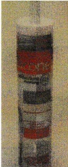
Tube of Clear, Waterproof Bath and Tile Silicone / Putty Knife

This is a fast and cost-effective method of sealing these porous surfaces