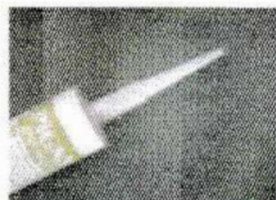
B. Attach Applicator