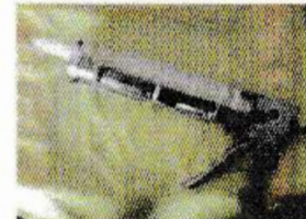
D. Load Caulking Gun

Use on parapets, ledges, windows, beams, patio covers, conduit, walls, barns, pipes, under tiles, roofs, under HVAC units, holes, under roof line and lights.