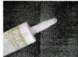
C. Cut Applicator