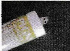
A. Cut Nozzle