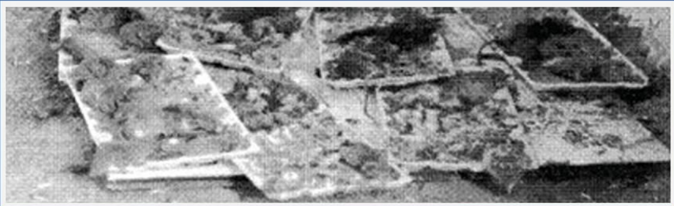
Trays of dead rats are pictured.

Western Exterminator placed hundreds of glue traps along the stall and perimeter walls prior to applying the DeTour Gel. Western used 25 gallons of the DeTour Gel and applied the product to burrows, trails, pipe chases and along the ground on the inside and outside of the stalls. After a few stalls had been treated the rodents were actively seeking a way out of the structure and there were so many running around that the applicators had to duct tape their pant legs to their ankles to prevent the rodents from running up their legs.