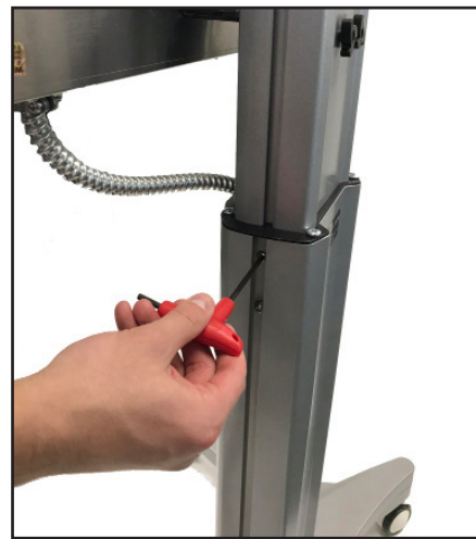
2. Use an allen wrench to loosen 4 screws (2 screws on each side) on the unit.