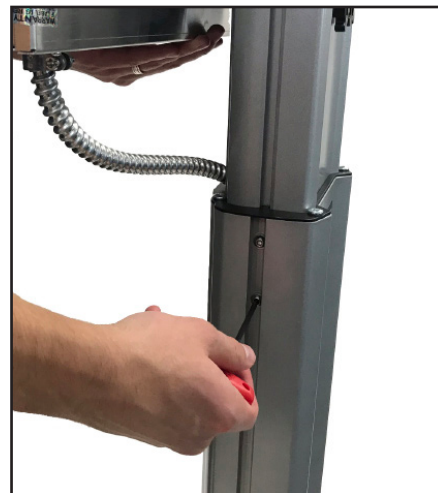
4. Using allen wrench, tighten 4 screws (2 on each side) on the unit.