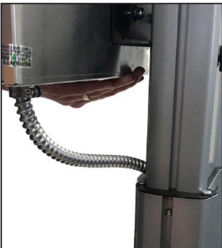
3. Raise or lower unit to desired height.