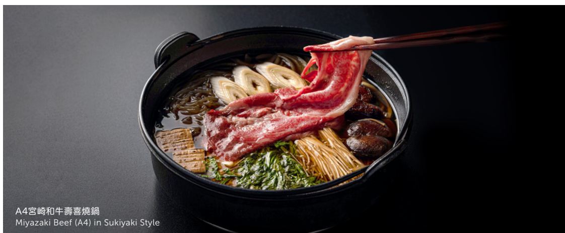
A4宮崎和牛壽喜燒鍋 Miyazaki Beef (A4) in Sukiyaki Style

配 日本米飯(新潟縣 越光米) 或 十五穀米 Please choose: Steamed Koshihikari Rice (from Niigata, Japan) or Steamed Grain Rice