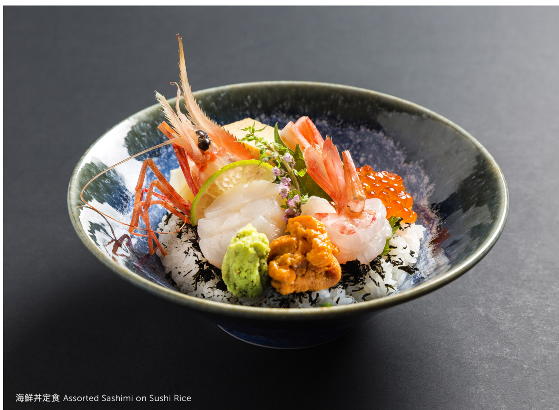
海鮮丼定食 Assorted Sashimi on Sushi Rice

配 日本米飯(新潟縣 越光米) 或 十五穀米 Please choose: Steamed Koshihikari Rice (from Niigata, Japan) or Steamed Grain Rice