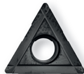
Art. Nr. 24201