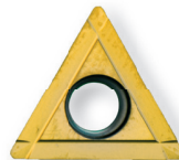
Art. Nr. 24204