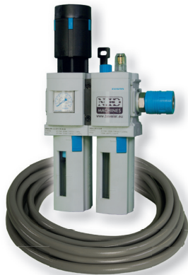
Art. Nr. 24203