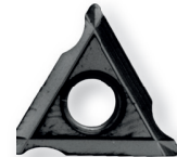
Art. Nr. 24202