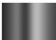
CRO - Cromo / Chrome