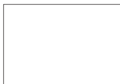
V02 - Bianco / White