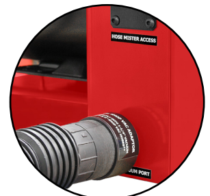
Available Vacuum Port