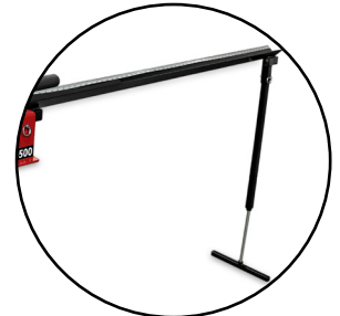
Hose Channel System