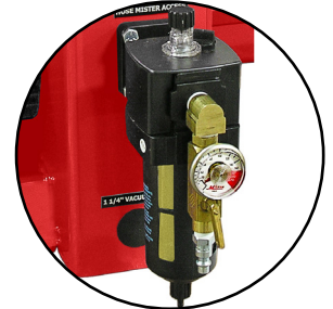
Mister Hose Assembly