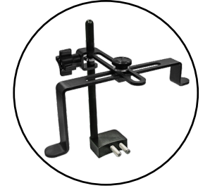
D165 Coupling Stop (Included) P/N:100954