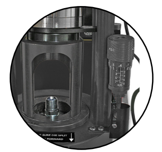
Automatic stop switch shuts the pump off when the crimp cycle is complete.