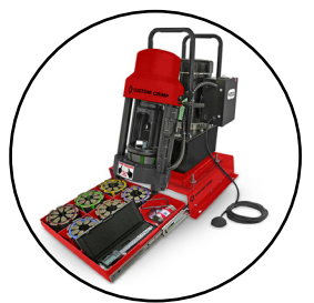
Crimper shown mounted on the Die Storage Drawer