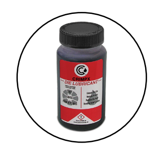
CRIMPX Die Lubricant: 4 oz bottle oil with dauber cap (Included) P/N:103886