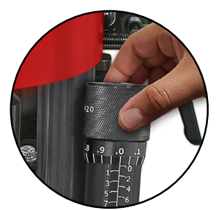
Accurate and Repeatable: Micrometer with "Micro-Crimp Adjuster" is fully adjustable to make precise and repeatable crimps.