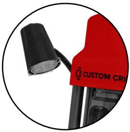
Flexible 24" Work Lamp (Optional) P/N:1668-02