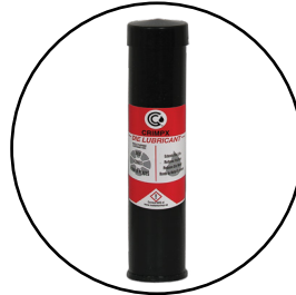
Available: CRIMPX Die Lubricant 3 oz mini grease tube P/N:103887