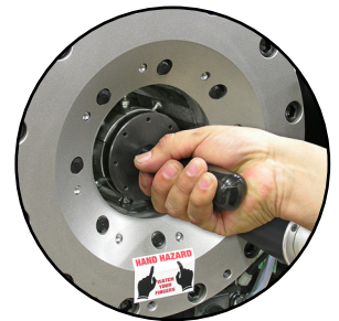
Quick Change Tool