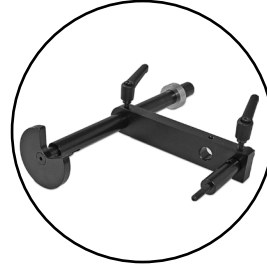
Manual Back Stop (Included) P/N:MBS-60