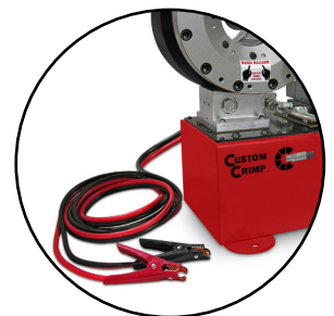
Available in 12VDC/24VDC