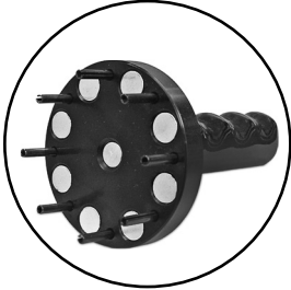
84mm Quick Change Tool (Included) P/N:102572