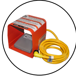
Foot Pedal Assembly (Included) P/N:104118