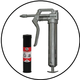
Mini Grease Gun w/ CRIMPX Die Lubricant 3 oz mini grease tube (Included) P/N:103889