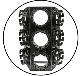
Die Rack 9 Station Die Holders (Included) P/N:102616-84mm