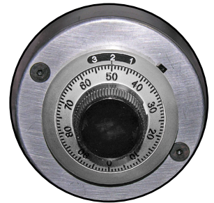
Metric Dial Micrometer