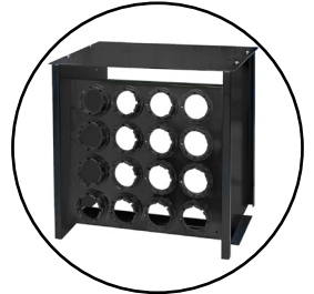
Available: Crimper Stand 16 Station Die Holders P/N:101247-84