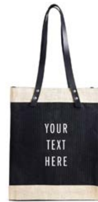
BDML034BKOS STANDARD MARKET TOTE BLACK