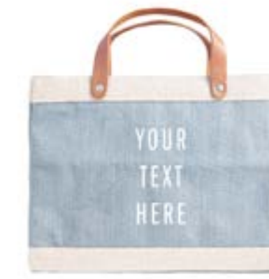
BDML035CLOS PETITE BAG COOL GREY