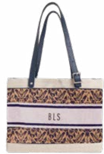
BDML035CHNGNAH PORCELAIN PETITE MARKET BAG NAVY