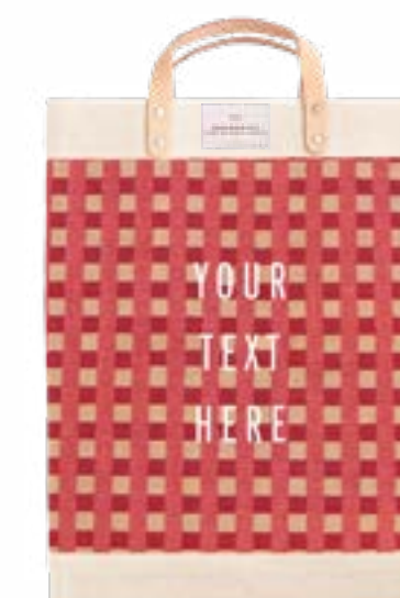
BDML003GHRD MARKET BAG RED GINGHAM