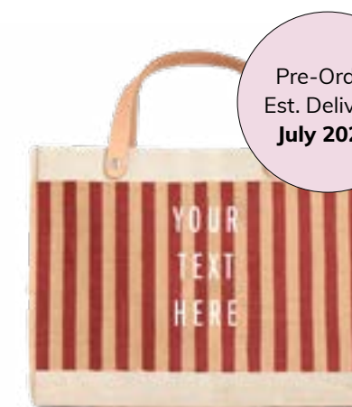
BDML035STRD PETITE BAG RED STRIPE