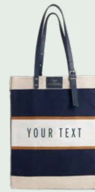
BDML003CHNNVAH CHENILLE MARKET NAVY