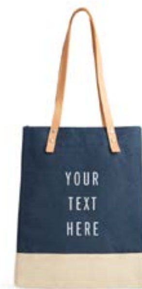
BDML033BKOS WINE TOTE NAVY