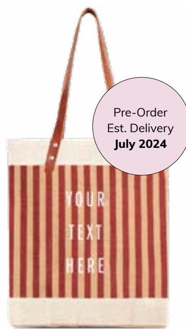
BDML034STRD STANDARD MARKET TOTE RED STRIPE