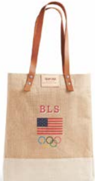
BDML035CHNGNAH TEAM USA WINE TOTE