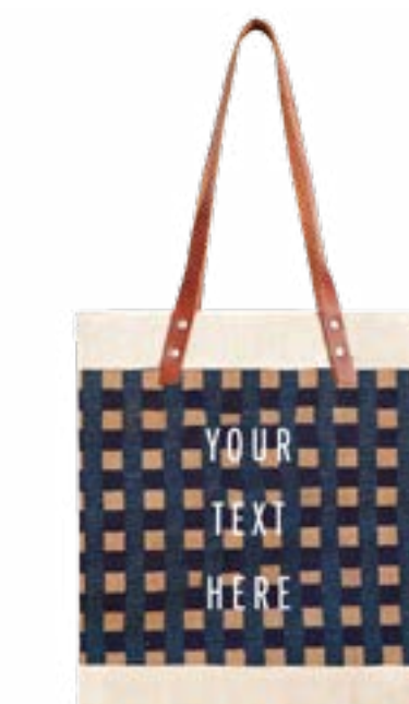
BDML034GHBL STANDARD MARKET TOTE BLUE GINGHAM