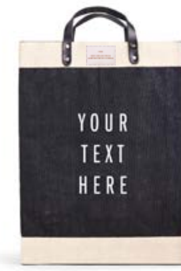
BDML003BKOS MARKET BAG BLACK