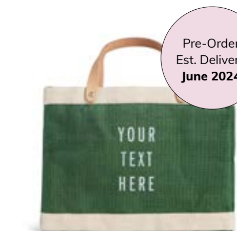
BDML035GNOS PETITE BAG FIELD GREEN