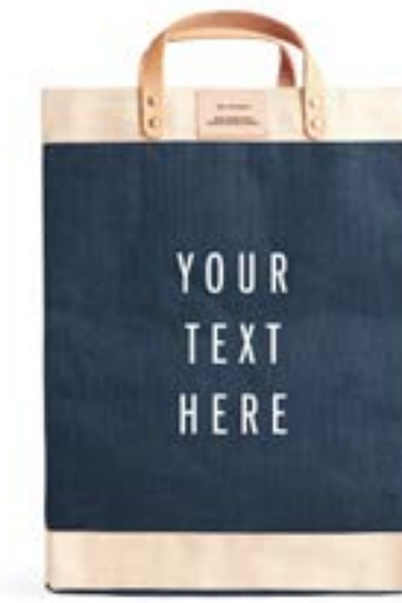
BDML003NVOS MARKET BAG NAVY