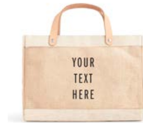
BDML035NAOS PETITE BAG NATURAL