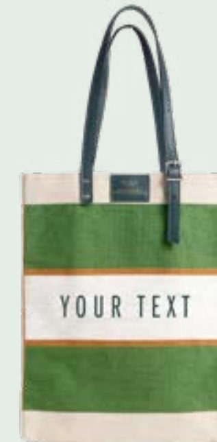
BDML003CHNGNAH CHENILLE MARKET GREEN