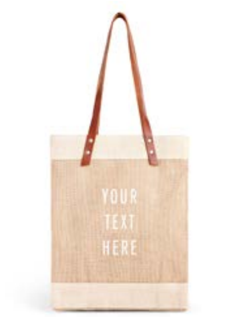
BDML034NAOS STANDARD MARKET TOTE NATURAL