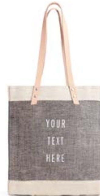
BDML034CHOS STANDARD MARKET TOTE CHAMBRAY