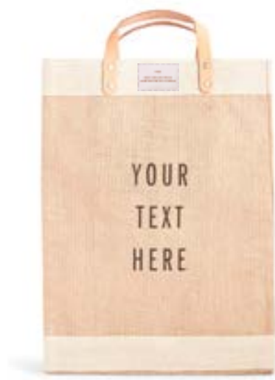
BDML003NAOS MARKET BAG NATURAL