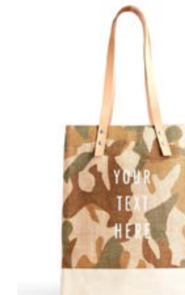
BDML033CLOS WINE TOTE SAFARI