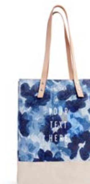
BDML033C0OS WINE TOTE BLUE BLOOM