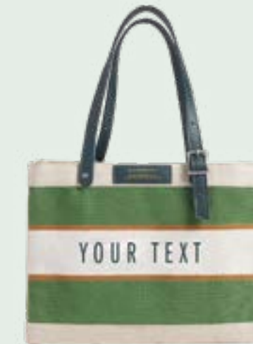
BDML035CHNGNAH CHENILLE PETITE GREEN