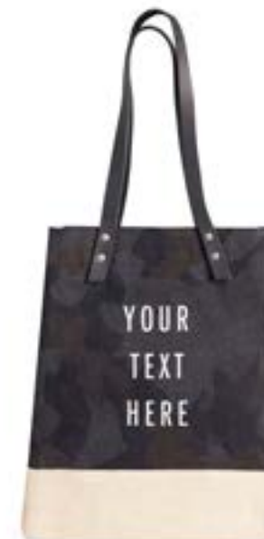
BDML033BKBLOS WINE TOTE SHADOW SAFARI