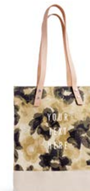
BDML033CHOS WINE TOTE BLACK BLOOM