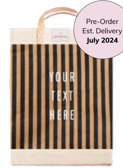
BDML003STNV MARKET BAG NAVY STRIPE