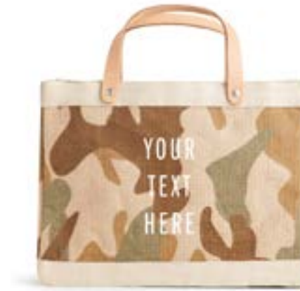
BDML035COOS PETITE BAG SAFARI