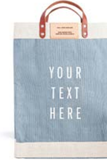
BDML003CLOS MARKET BAG COOL GREY