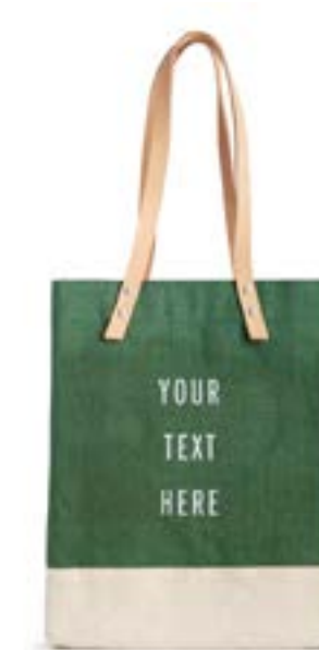
BDML033GNOS WINE TOTE GREEN