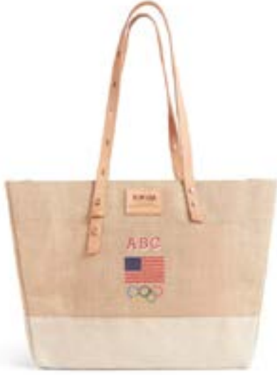
BDML035CHNGNAH TEAM USA SHOULDER MARKET TOTE