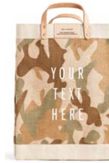
BDML003GDOS MARKET BAG SAFARI