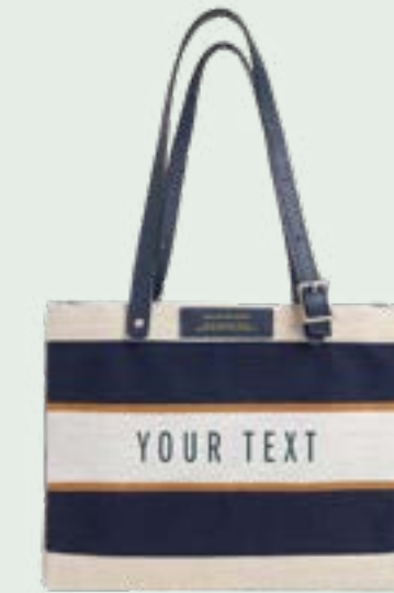
BDML035CHNNVAH CHENILLE PETITE NAVY