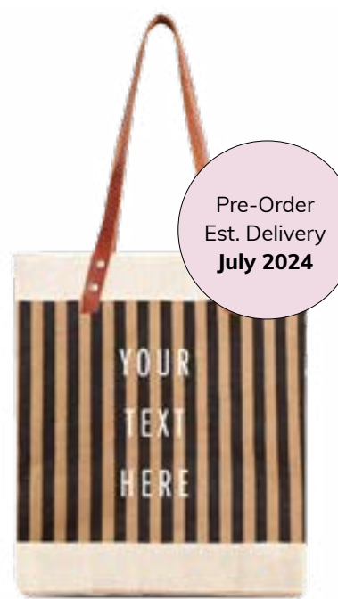
BDML034STNV STANDARD MARKET TOTE NAVY STRIPE