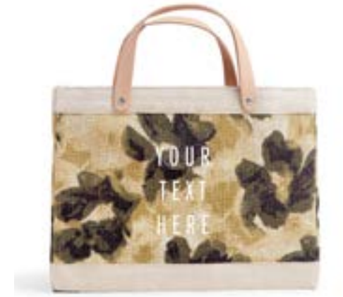
BDML035BKBLOS PETITE BAG BLACK BLOSSOM