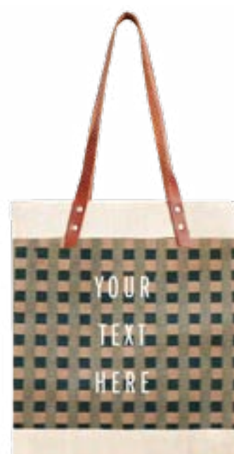
BDML034GHGN STANDARD MARKET TOTE GREEN GINGHAM