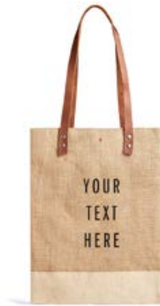
BDML033NAOS WINE TOTE NATURAL