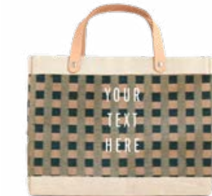
BDML035GHGN PETITE BAG GREEN GINGHAM