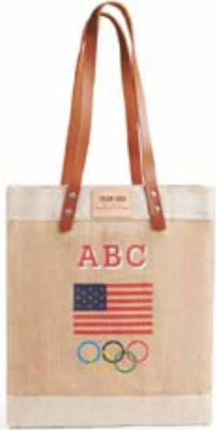
BDML035CHNNVAH TEAM USA STANDARD MARKET TOTE