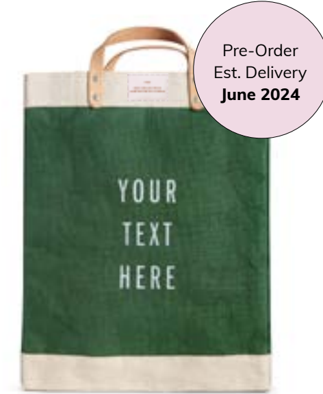
BDML003GNOS MARKET BAG FIELD GREEN