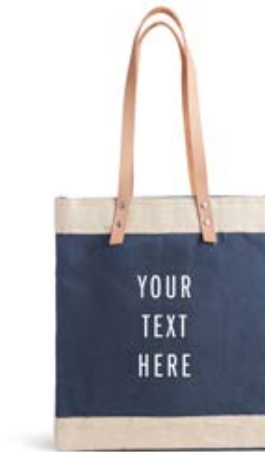
BDML034NVOS STANDARD MARKET TOTE NAVY