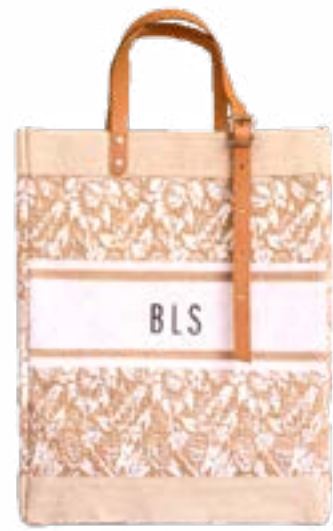
BDML003CHNNVAH PORCELAIN MARKET BAG WHITE