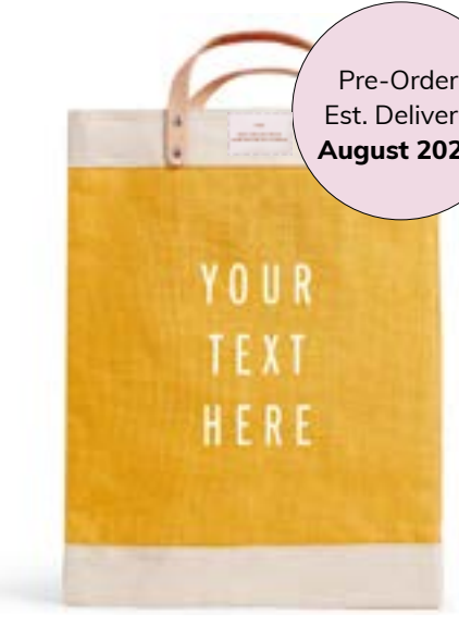
BDML003BKBLOS MARKET BAG GOLD