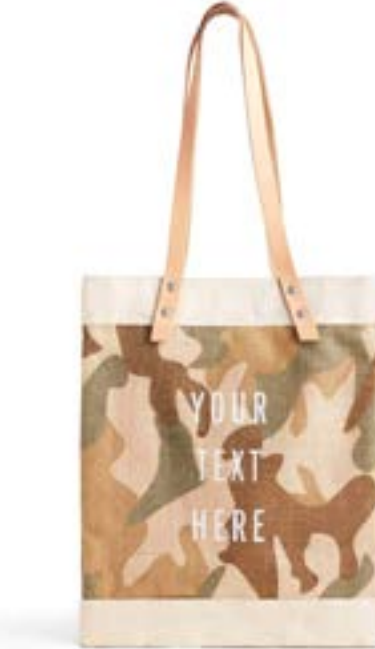
BDML034COOS STANDARD MARKET TOTE SAFARI