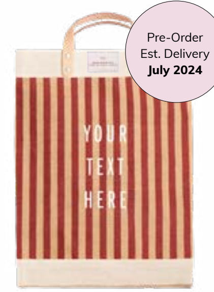
BDML003STRD MARKET BAG RED STRIPE