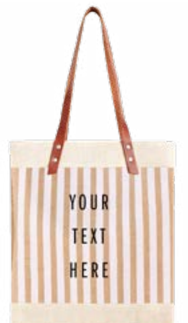
BDML034STWH STANDARD MARKET TOTE WHITE STRIPE