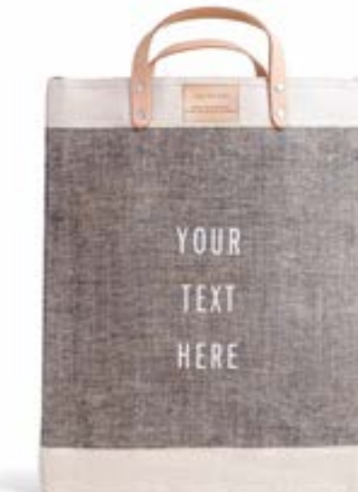
BDML003COOS MARKET BAG CHAMBRAY