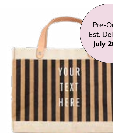
BDML035STNV PETITE BAG NAVY STRIPE