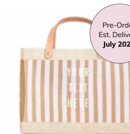
BDML035STWH PETITE BAG WHITE STRIPE