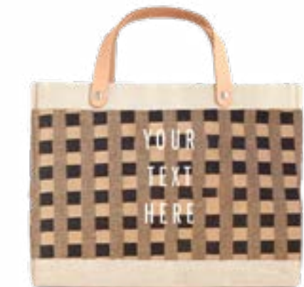
BDML035GHBK PETITE BAG BLACK GINGHAM