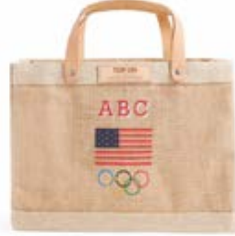
BDML003CHNGNAH TEAM USA PETITE MARKET BAG