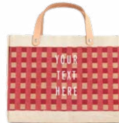
BDML035GHRD PETITE BAG RED GINGHAM