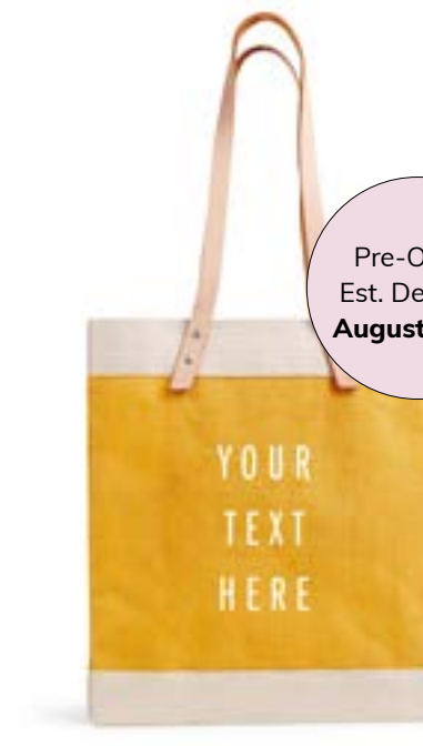
BDML034GDOS STANDARD MARKET TOTE GOLD