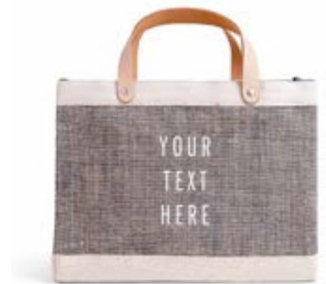
BDML035CHOS PETITE BAG CHAMBRAY