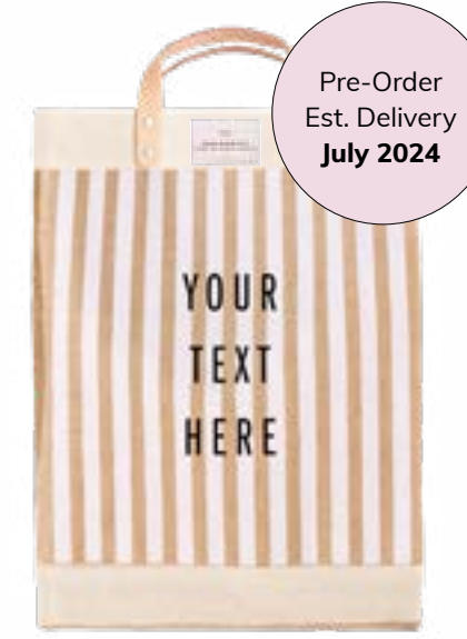
BDML003STWH MARKET BAG WHITE STRIPE