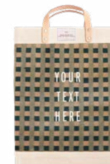
BDML003GHGN MARKET BAG GREEN GINGHAM