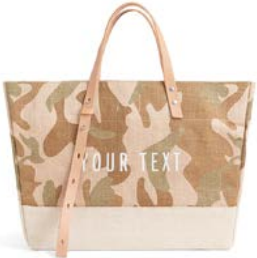
BDML004C00S SHOULDER MARKET BAG SAFARI