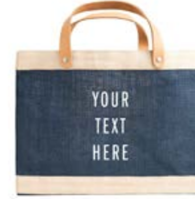
BDML035NVOS PETITE BAG NAVY