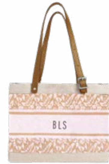
BDML035CHNNVAH PORCELAIN PETITE MARKET BAG WHITE