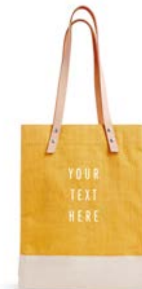
BDML033BBLOS WINE TOTE GOLD