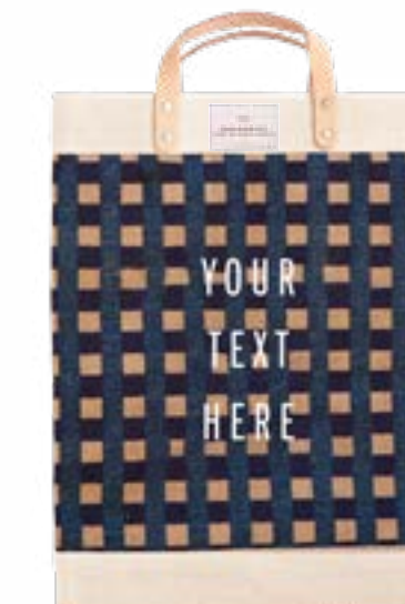
BDML003GHBL MARKET BAG BLUE GINGHAM