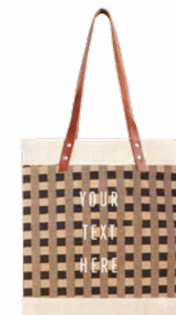
BDML034GHBK STANDARD MARKET TOTE BLACK GINGHAM