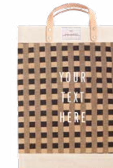
BDML003GHBK MARKET BAG BLACK GINGHAM