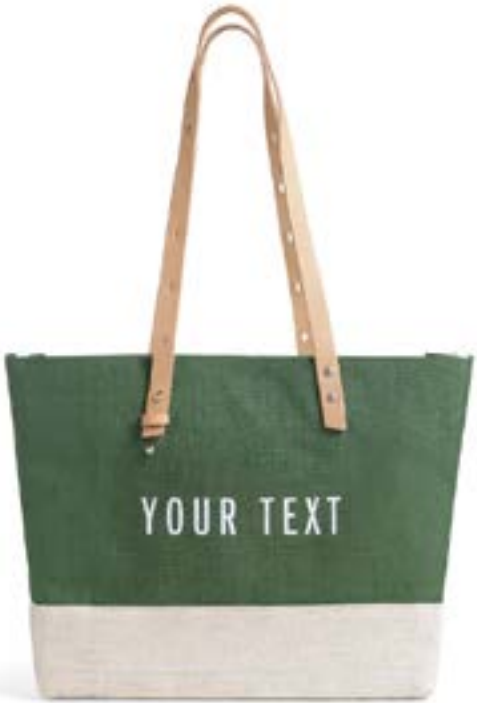
BDML004GNOS SHOULDER MARKET BAG GREEN