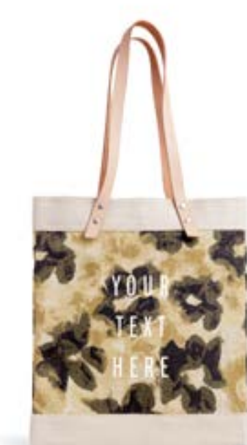
BDML034BKBLOS STANDARD MARKET TOTE BLACK BLOSSOM