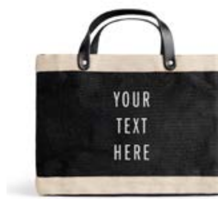
BDML035BKOS PETITE BAG BLACK