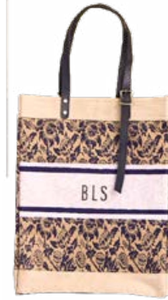
BDML003CHNGNAH PORCELAIN MARKET BAG NAVY