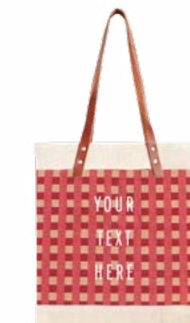
BDML034GHRD STANDARD MARKET TOTE RED GINGHAM