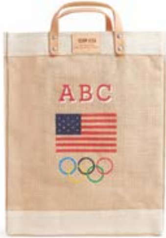
BDML003CHNNVAH TEAM USA MARKET BAG