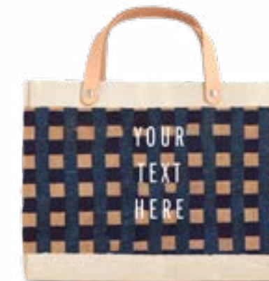
BDML035GHBL PETITE BAG BLUE GINGHAM