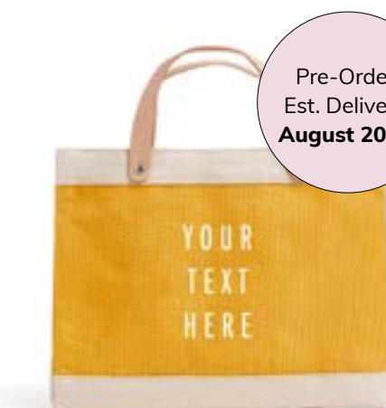
BDML035GDOS PETITE BAG GOLD