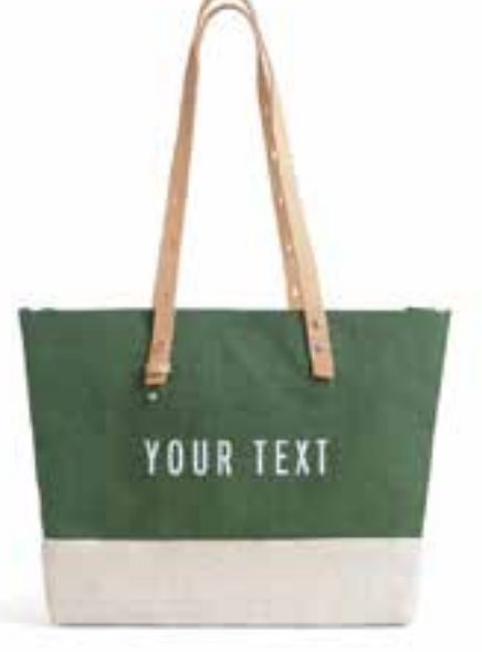
BDML004GNOS SHOULDER MARKET BAG GREEN