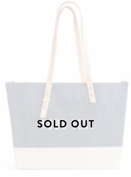
BDML004NVOS SHOULDER MARKET BAG NAVY