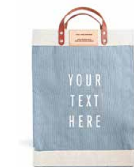
BDML003CLOS MARKET BAG COOL GREY