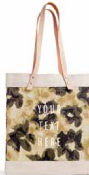
BDML034BKBLOS STANDARD MARKET TOTE BLACK BLOSSOM