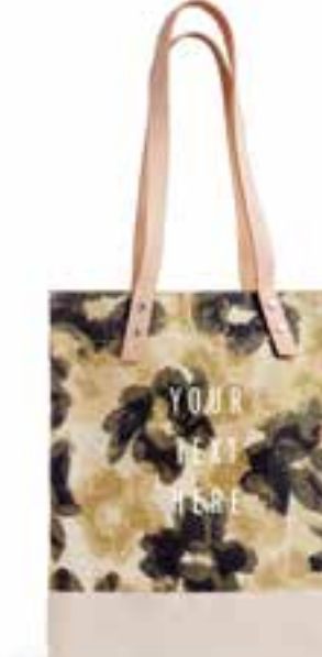
BDML033CHOS WINE TOTE BLACK BLOOM