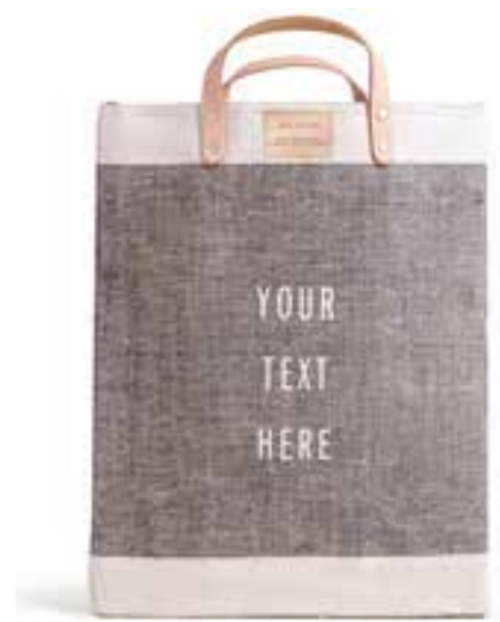
BDML003COOS MARKET BAG CHAMBRAY