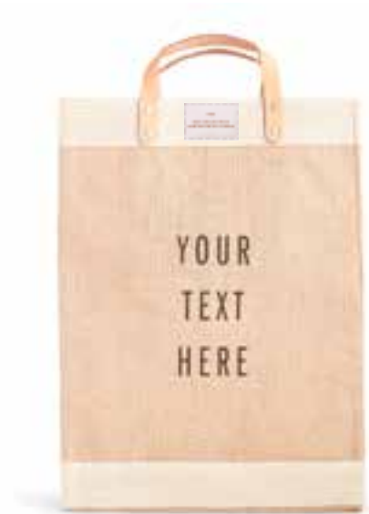
BDML003NAOS MARKET BAG NATURAL