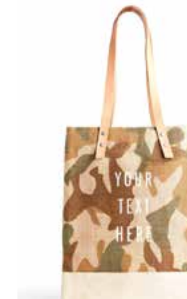
BDML033CLOS WINE TOTE SAFARI