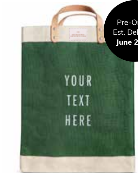
BDML003GNOS MARKET BAG FIELD GREEN