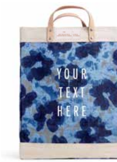
BDML003CHOS MARKET BAG BLUE BLOSSOM