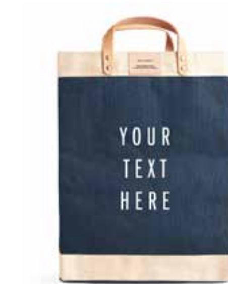
BDML003NVOS MARKET BAG NAVY