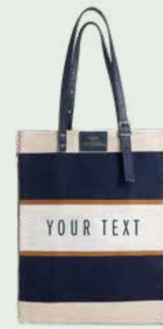
BDML003CHNNVAH CHENILLE MARKET NAVY