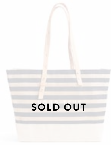
BDML004NANS SHOULDER MARKET BAG NAVY STRIPE