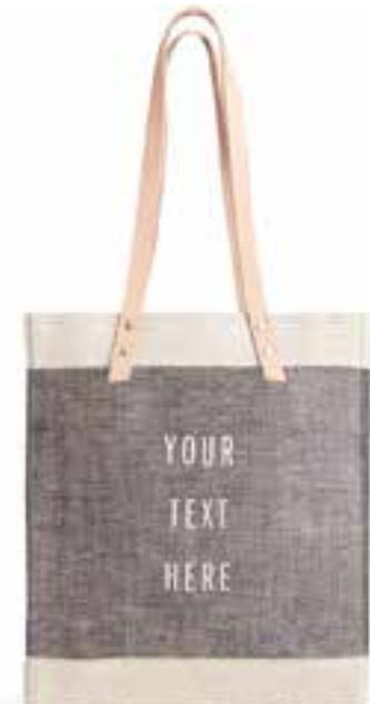
BDML034CHOS STANDARD MARKET TOTE CHAMBRAY