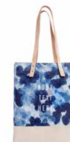
BDML033C0OS WINE TOTE BLUE BLOOM