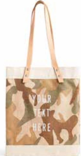
BDML034COOS STANDARD MARKET TOTE SAFARI