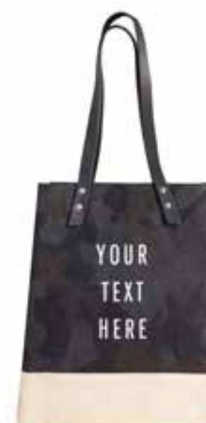
BDML033BKBLOS WINE TOTE SHADOW SAFARI