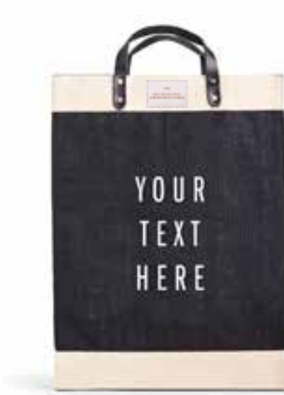
BDML003BKOS MARKET BAG BLACK