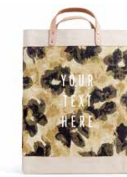
BDML003BBLOS MARKET BAG BLACK BLOSSOM