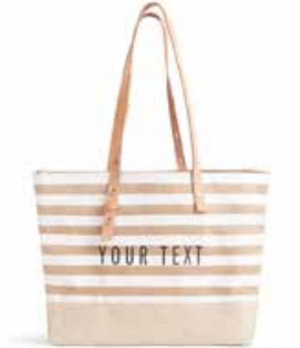
BDML004NAWS SHOULDER MARKET BAG WHITE STRIPE