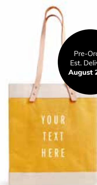
BDML034GDOS STANDARD MARKET TOTE GOLD