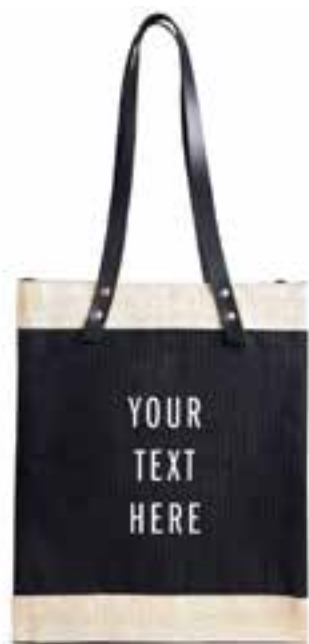
BDML034BKOS STANDARD MARKET TOTE BLACK