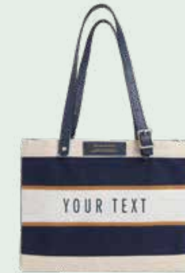
BDML035CHNNVAH CHENILLE PETITE NAVY