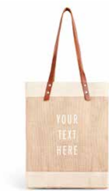
BDML034NAOS STANDARD MARKET TOTE NATURAL