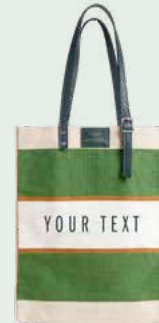
BDML003CHNGNAH CHENILLE MARKET GREEN