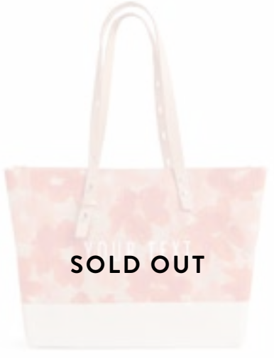
BDML004FLOS SHOULDER MARKET BAG BLOOM