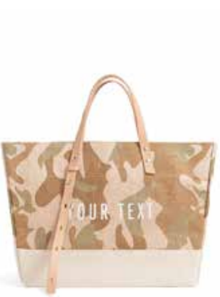
BDML004COOS SHOULDER MARKET BAG SAFARI