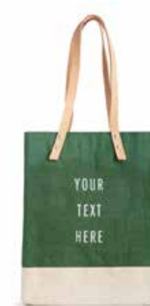
BDML033GNOS WINE TOTE GREEN