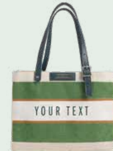
BDML035CHNGNAH CHENILLE PETITE GREEN