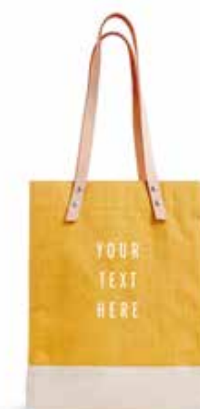
BDML033BBLOS WINE TOTE GOLD