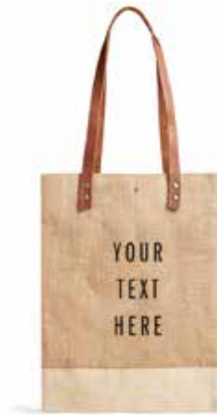
BDML033NAOS WINE TOTE NATURAL