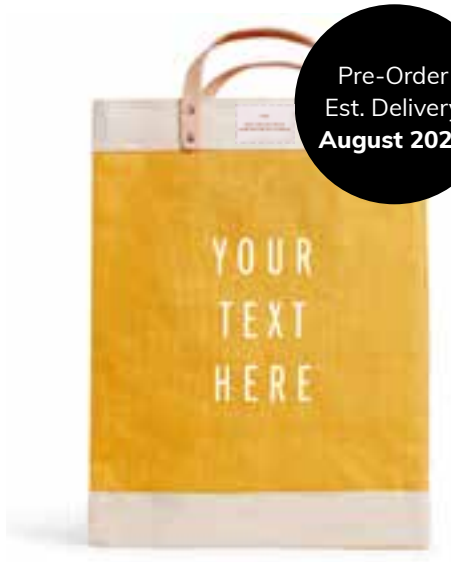
BDML003BKBLOS MARKET BAG GOLD