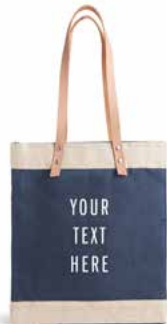
BDML034NVOS STANDARD MARKET TOTE NAVY