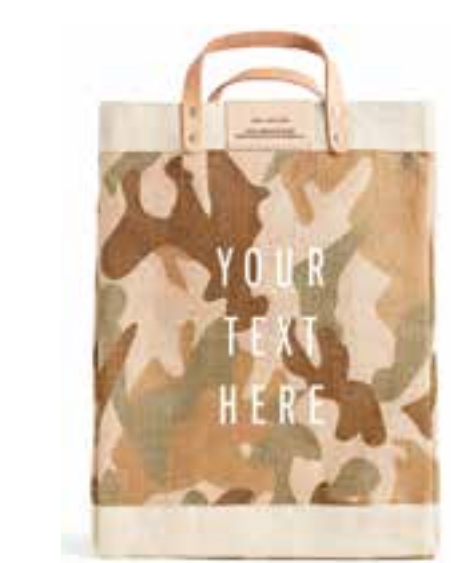
BDML003GDOS MARKET BAG SAFARI