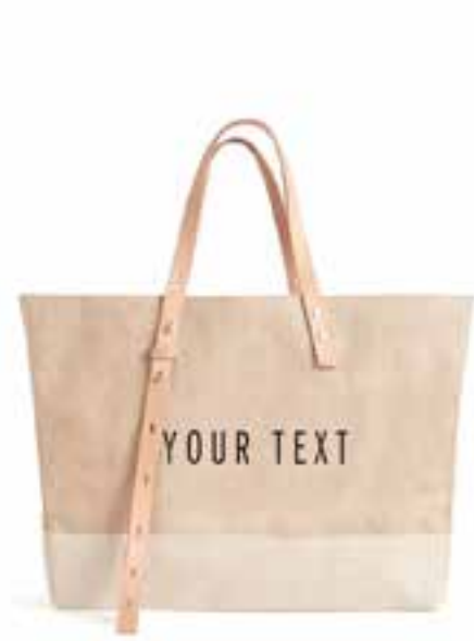
BDML004NAOS SHOULDER MARKET BAG NATURAL