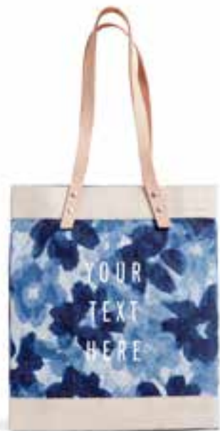
BDML034BBLOS STANDARD MARKET TOTE BLUE BLOSSOM