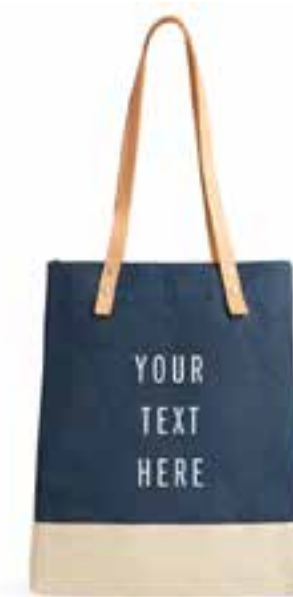
BDML033BKOS WINE TOTE NAVY