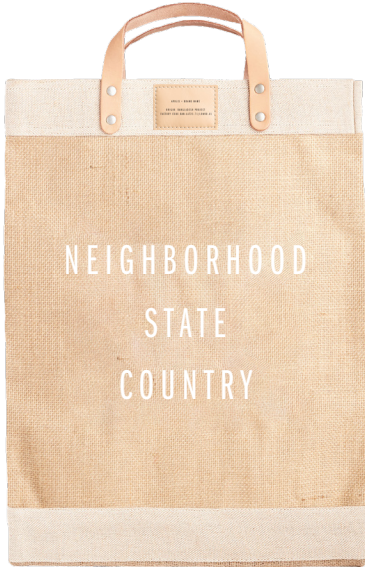
Market Bag in Natural