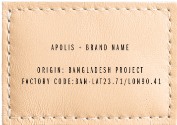
Leather Label in Natural