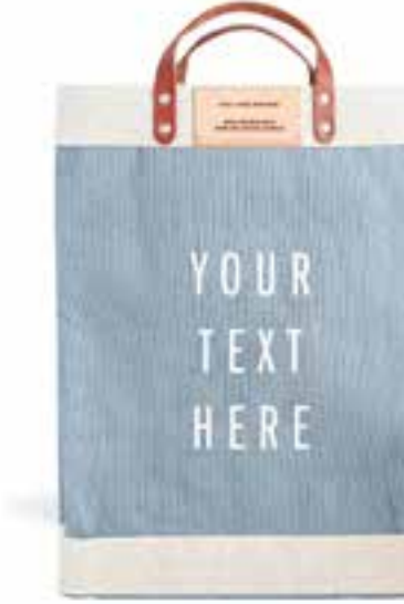
BDML003CLOS MARKET BAG COOL GREY