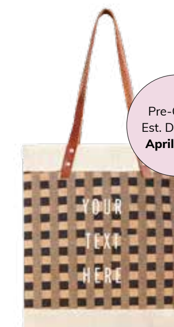
BDML034GHBK STANDARD MARKET TOTE BLACK GINGHAM