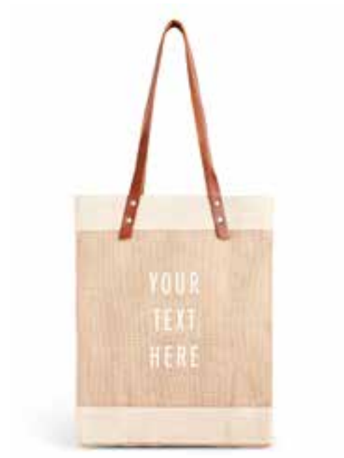
BDML034NAOS STANDARD MARKET TOTE NATURAL