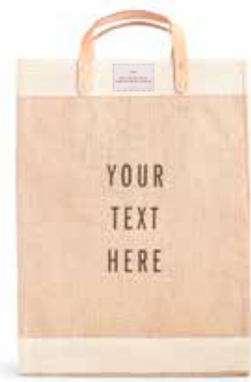
BDML003NAOS MARKET BAG NATURAL