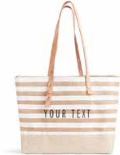
BDML004NAWS SHOULDER MARKET BAG WHITE STRIPE