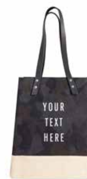
BDML033BKBLOS WINE TOTE SHADOW SAFARI