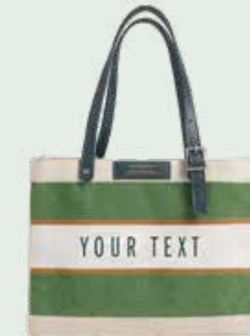
BDML035CHNGNAH CHENILLE PETITE GREEN