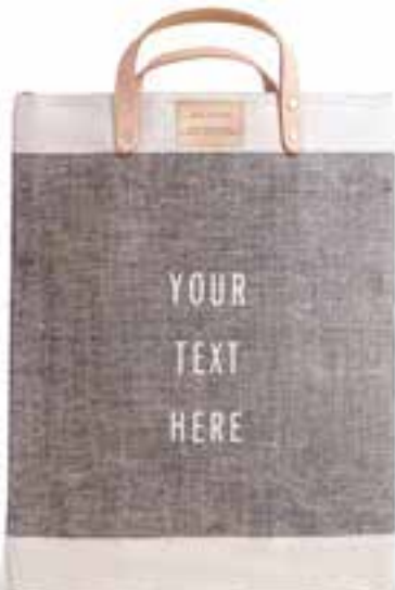
BDML003COOS MARKET BAG CHAMBRAY