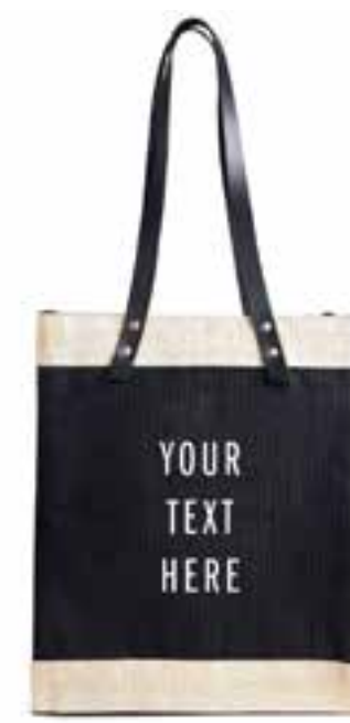
BDML034BKOS STANDARD MARKET TOTE BLACK