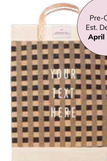
BDML003GHBK MARKET BAG BLACK GINGHAM