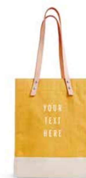
BDML033BBLOS WINE TOTE GOLD