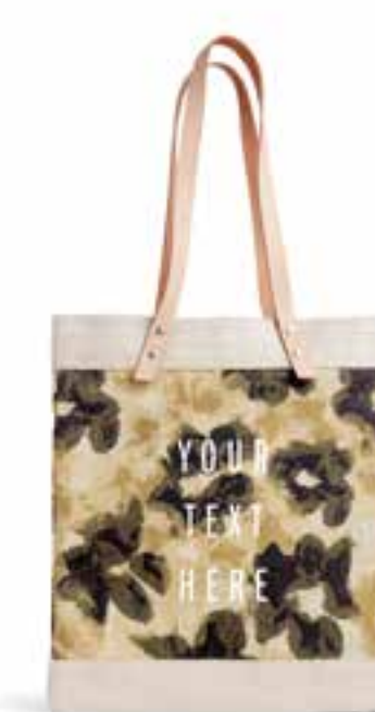
BDML034BKBLOS STANDARD MARKET TOTE BLACK BLOSSOM