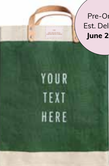
BDML003GNOS MARKET BAG FIELD GREEN