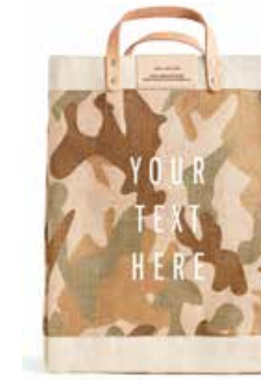
BDML003GDOS MARKET BAG SAFARI