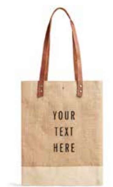
BDML033NAOS WINE TOTE NATURAL