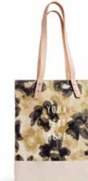
BDML033CHOS WINE TOTE BLACK BLOOM