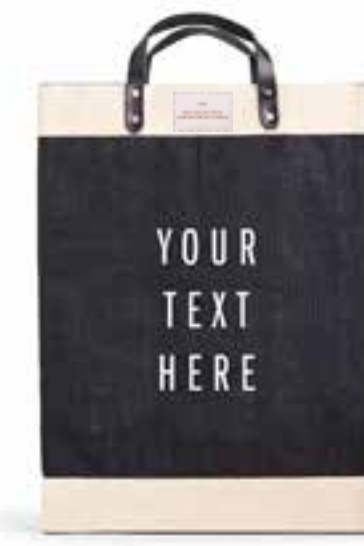
BDML003BKOS MARKET BAG BLACK