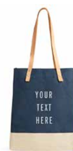
BDML033BKOS WINE TOTE NAVY