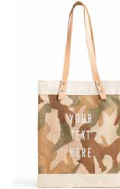
BDML034COOS STANDARD MARKET TOTE SAFARI