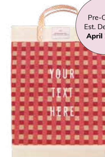
BDML003GHRD MARKET BAG RED GINGHAM