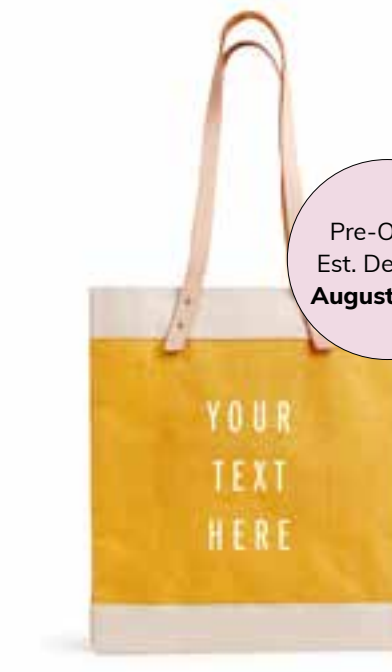
BDML034GDOS STANDARD MARKET TOTE GOLD