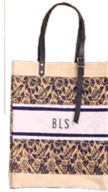
BDML003CHNGNAH PORCELAIN MARKET BAG NAVY