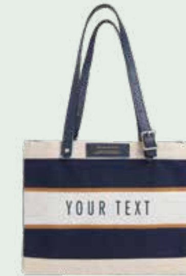
BDML035CHNNVAH CHENILLE PETITE NAVY