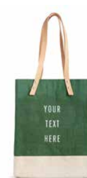
BDML033GNOS WINE TOTE GREEN