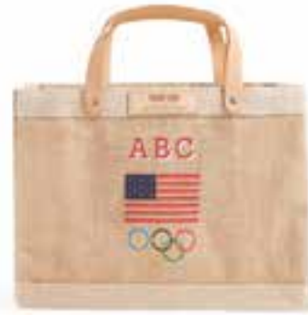
BDMLO03CHNGNAH TEAM USA PETITE MARKET BAG