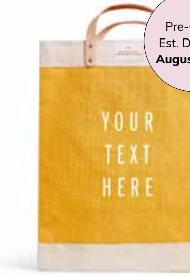
BDML003BKBLOS MARKET BAG GOLD