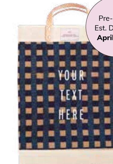
BDML003GHBL MARKET BAG BLUE GINGHAM