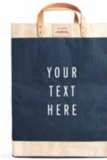
BDML003NVOS MARKET BAG NAVY