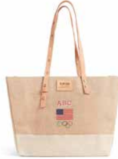
BDML035CHNGNAH TEAM USA SHOULDER MARKET TOTE