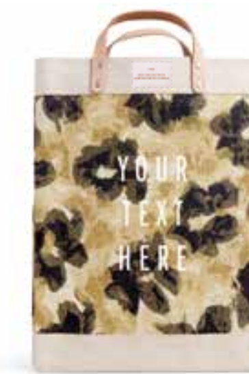
BDML003BBLOS MARKET BAG BLACK BLOSSOM