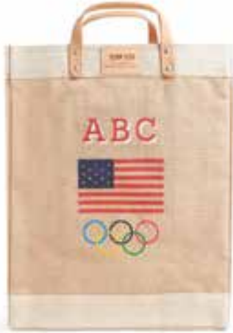
BDMLO03CHNNVAH TEAM USA MARKET BAG