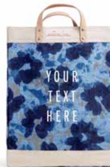
BDML003CHOS MARKET BAG BLUE BLOSSOM