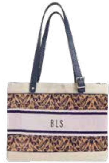
BDML035CHNGNAH PORCELAIN PETITE MARKET BAG NAVY