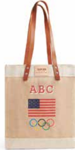
BDML035CHNNVAH TEAM USA STANDARD MARKET TOTE