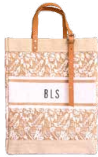
BDML003CHNNVAH PORCELAIN MARKET BAG WHITE