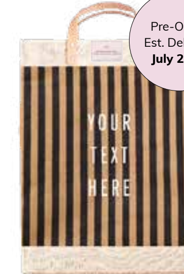
BDML003STNV MARKET BAG NAVY STRIPE