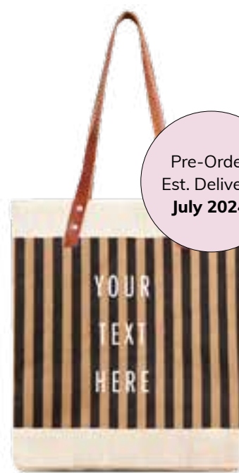
BDML034STNV STANDARD MARKET TOTE NAVY STRIPE