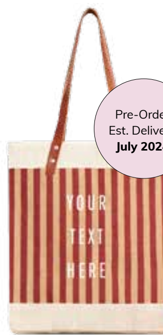
BDML034STRD STANDARD MARKET TOTE RED STRIPE