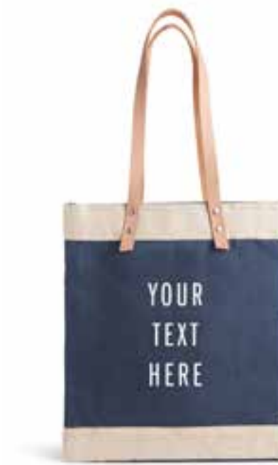
BDML034NVOS STANDARD MARKET TOTE NAVY