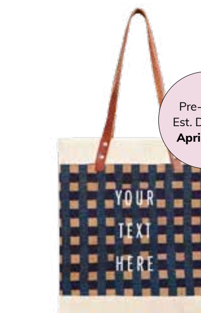
BDML034GHBL STANDARD MARKET TOTE BLUE GINGHAM