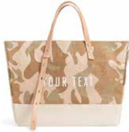
BDML004COOS SHOULDER MARKET BAG SAFARI