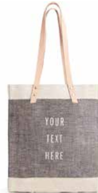
BDML034CHOS STANDARD MARKET TOTE CHAMBRAY