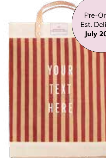
BDML003STRD MARKET BAG RED STRIPE