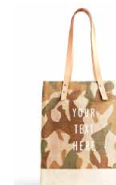
BDML033CLOS WINE TOTE SAFARI