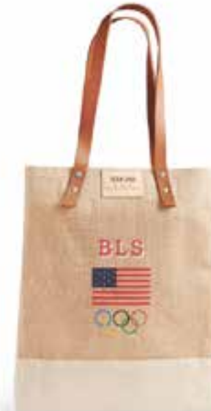
BDML035CHNGNAH TEAM USA WINE TOTE