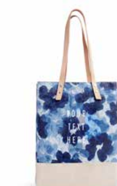
BDML033COOS WINE TOTE BLUE BLOOM