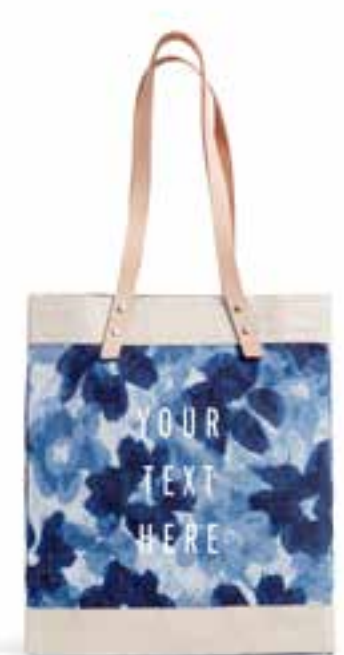
BDML034BBLOS STANDARD MARKET TOTE BLUE BLOSSOM