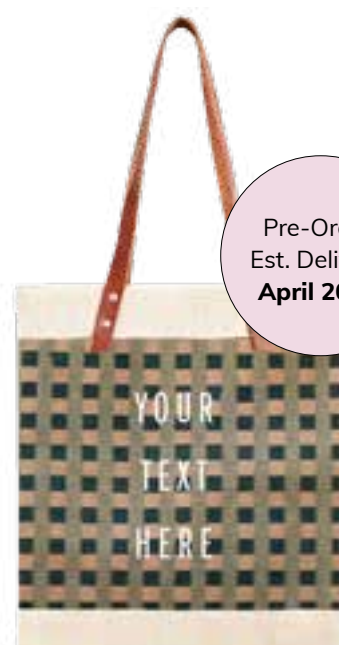
BDML034GHGN STANDARD MARKET TOTE GREEN GINGHAM