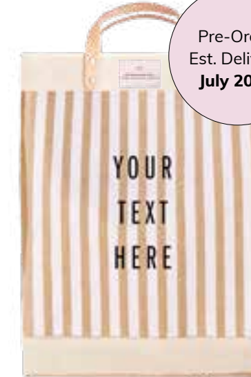
BDML003STWH MARKET BAG WHITE STRIPE