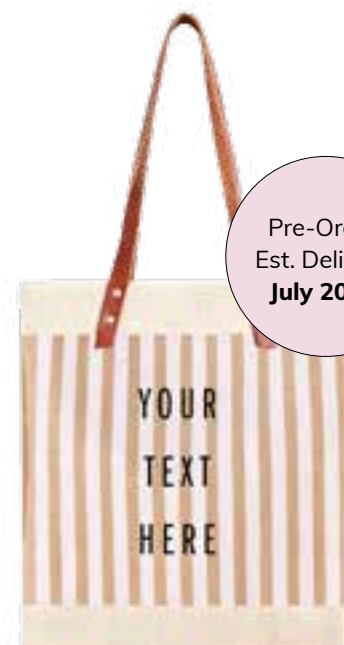
BDML034STWH STANDARD MARKET TOTE WHITE STRIPE