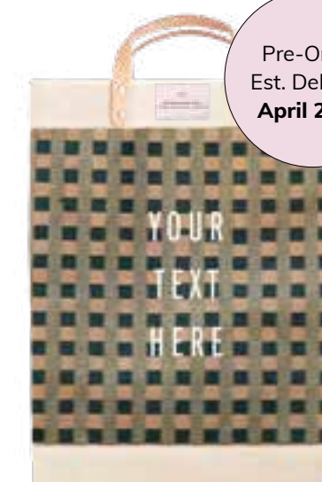
BDML003GHGN MARKET BAG GREEN GINGHAM