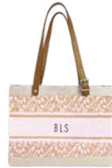
BDML035CHNNVAH PORCELAIN PETITE MARKET BAG WHITE