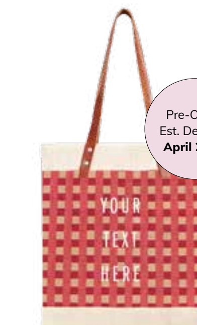
BDML034GHRD STANDARD MARKET TOTE RED GINGHAM