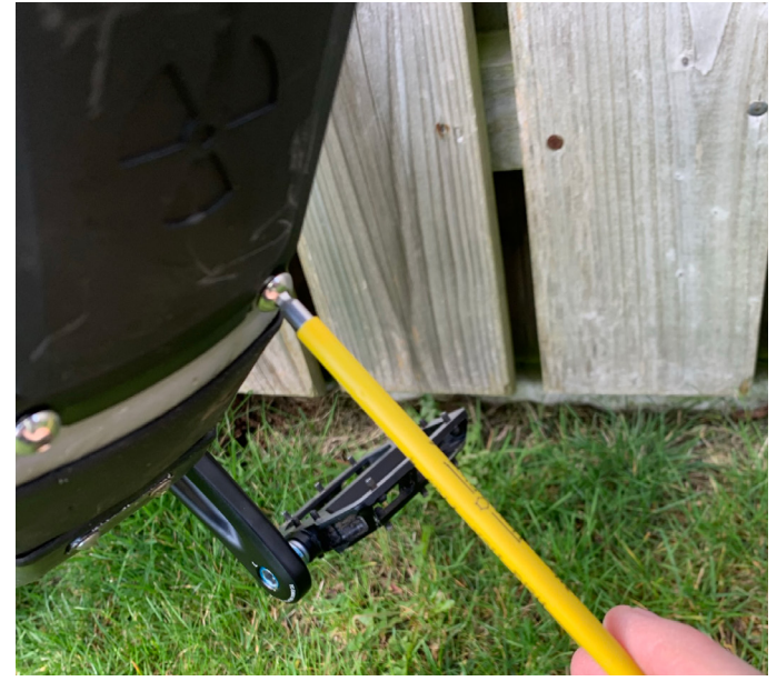
Loosen the bottom right hand bolt on the battery door 1 full turn using your 4mm hex key