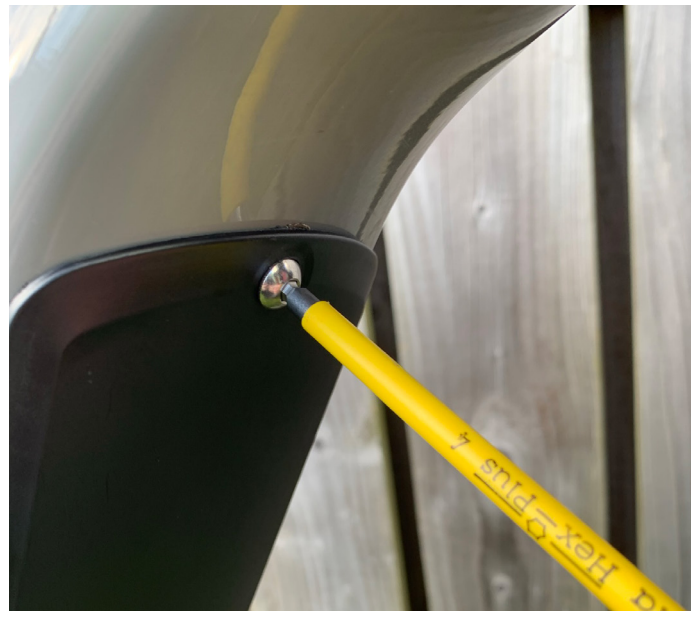
4. Fully remove the top battery door bolt