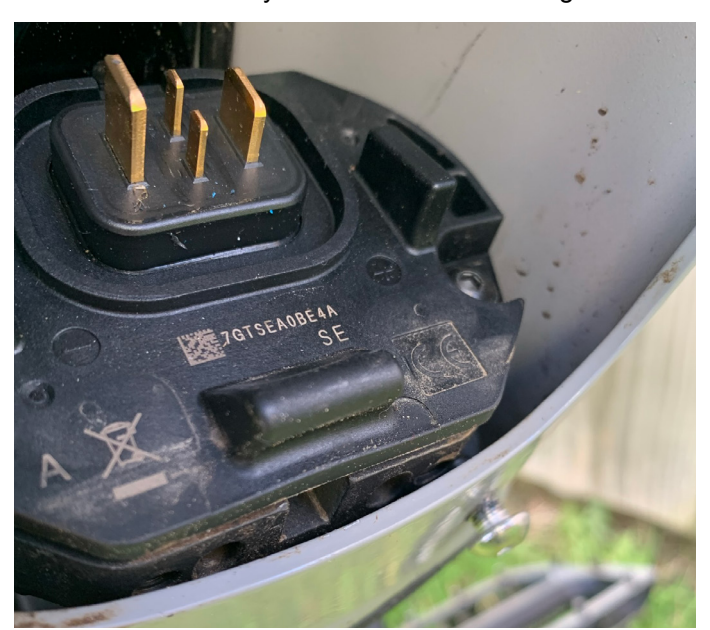
11. Rotate the battery so that the locating plastic part on the mount lines up to the hole in the battery casing