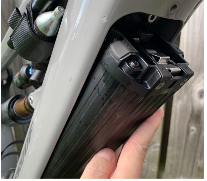
12. Line the battery up and push into the frame