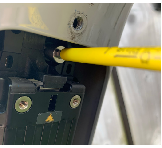
Using your 4mm hex key, carefully turn the silver battery release bolt CLOCKWISE