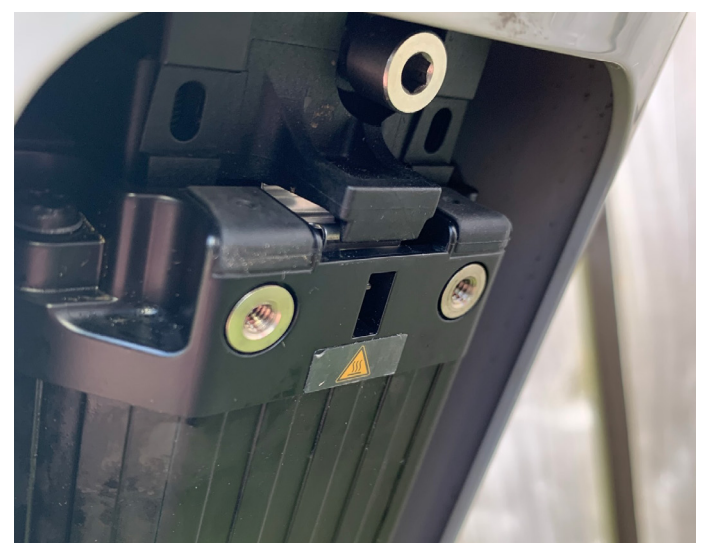
13. The battery should be fully seated after you hear two clicks