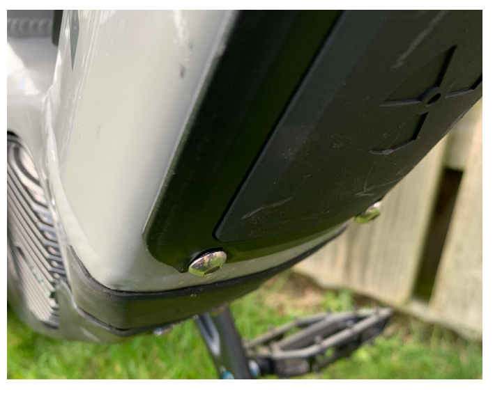
14. Slide your battery door back into place