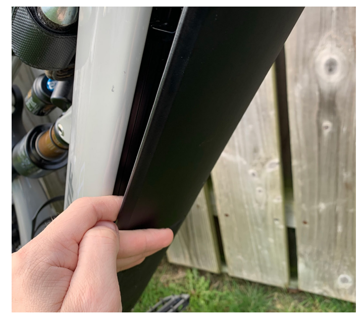
5. Slide the battery door upwards to remove