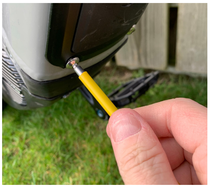
Loosen the bottom left hand bolt on the battery door1 full turn using your 4mm hex key