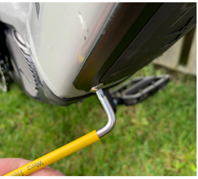
16. Tighten the lower left bolt using your 4mm hex key