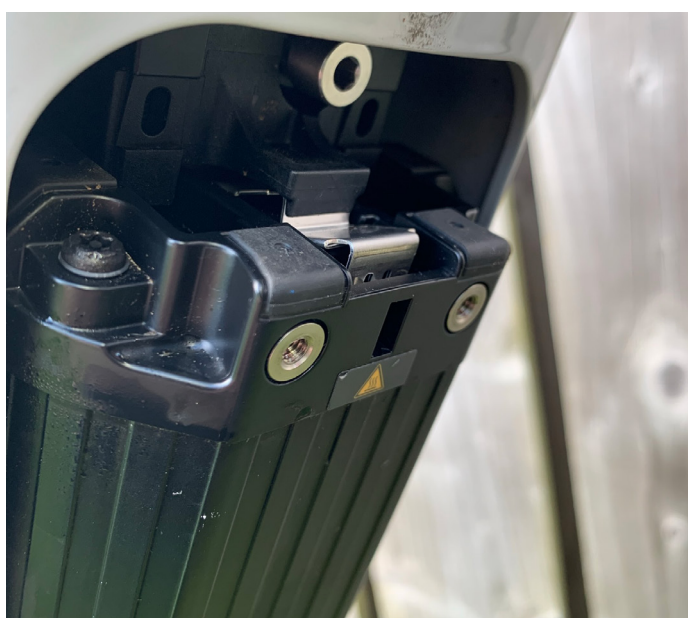
7. The battery should slide forwards and stop as per photo