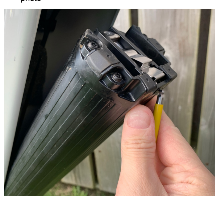
9. Lift the battery out of the frame