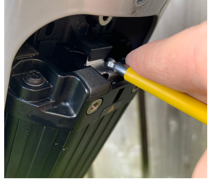
8. Push the silver clip down to fully release the battery