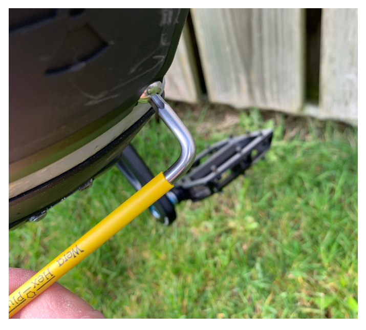
17. Tighten the lower right bolt using your 4mm hex key

Your battery has now been refitted and you are ready to ride