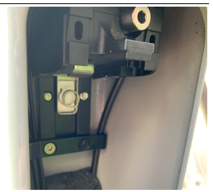
10. Check the battery holder to ensure it is in good condition and there is no damage to any part of it