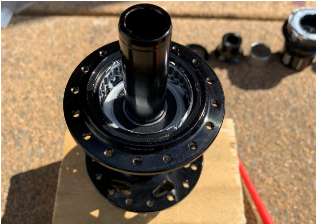
7. Set the hub on the support non-driveside down.