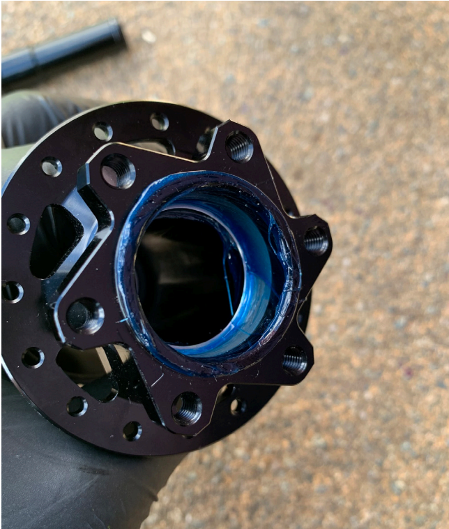
14. Check the inside of the non-driveside of the hub shell to ensure it is smooth and free from burrs then apply grease to aid bearing installation.