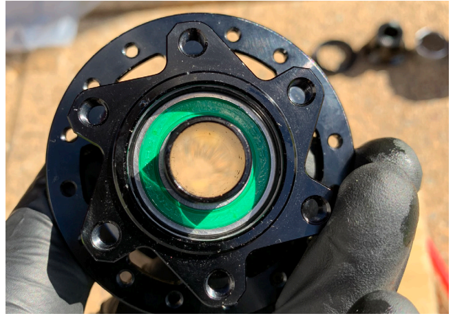
6. The bearing should now be visible.