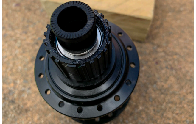
27. Refit driveside end cap.