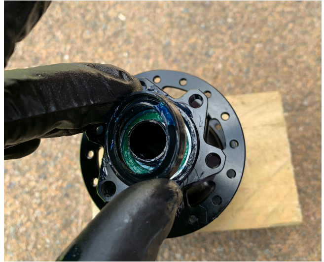
19. Apply grease to the non-driveside seal and press back into place.