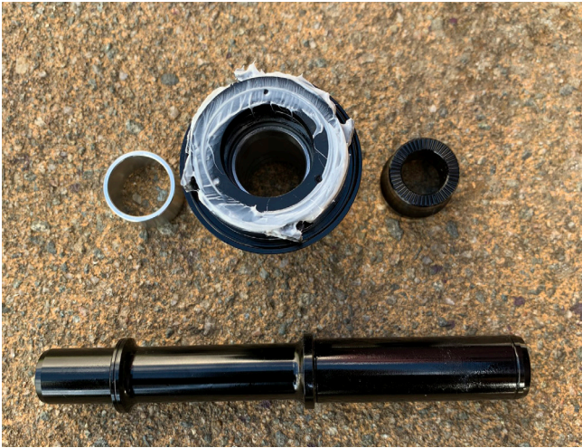
13. Set the old freehub, axle, spacer and end cap to the side. These parts are now not required.