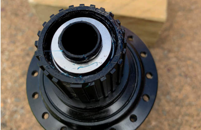
26. Apply the dust cover for the bearing