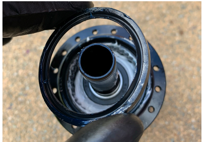
21. If you removed the driveside seal in step 11, apply grease to the new seal and press into place. The "V" lip should face outwards