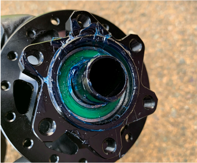
18. Apply grease to the outside non-driveside bearing.