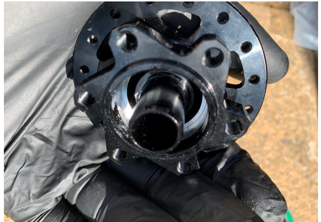
10. Remove the axle from the hub.