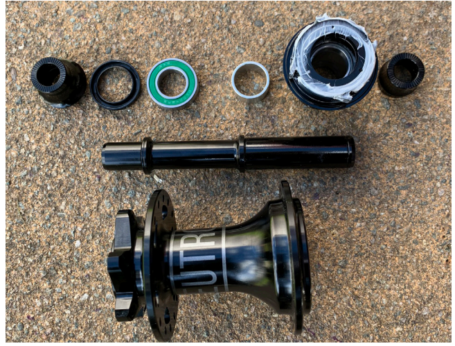
12. The hub is now stripped.