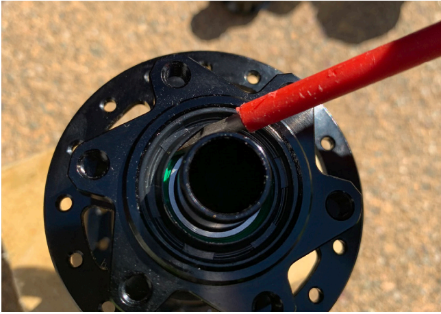
5. Remove the seal on the non-driveside using your flat head screwdriver.