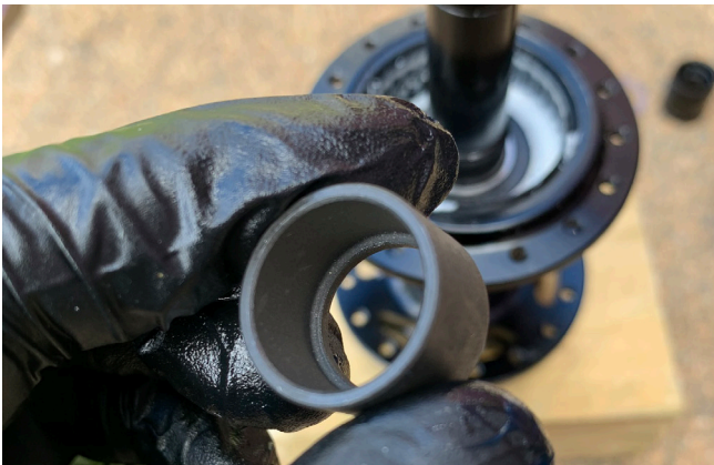
22. Get the freehub spacer and fit on the axle.

NOTE: There is a step inside this so it will only fit one way and should cover the step on the axle.