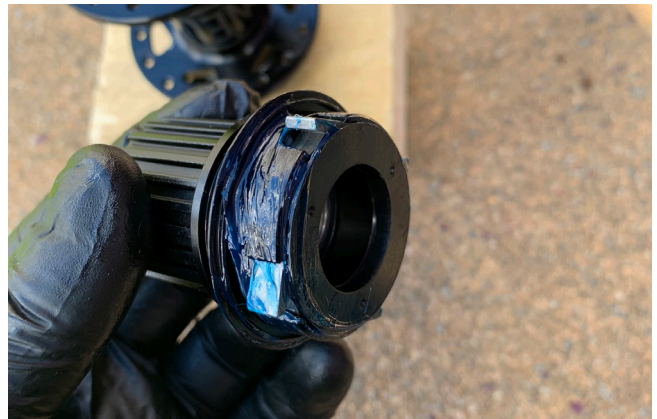
23. Apply grease to the freehub pawls and springs.

NOTE: There is a step inside this so it will only fit one way and should cover the step on the axle.