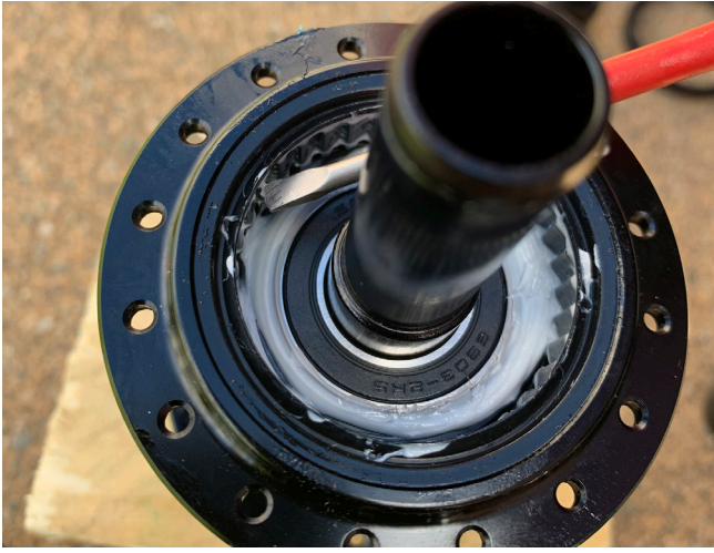
11. A new driveside seal is supplied with the freehub. If your seal is damaged it can be removed with the hub shell using the flat headscrew driver but this is not essential unless it is damaged.