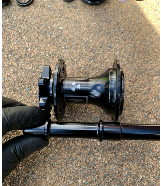
15. Insert the micro-spline axle into the hub from the non-driveside – stepped section is the driveside.