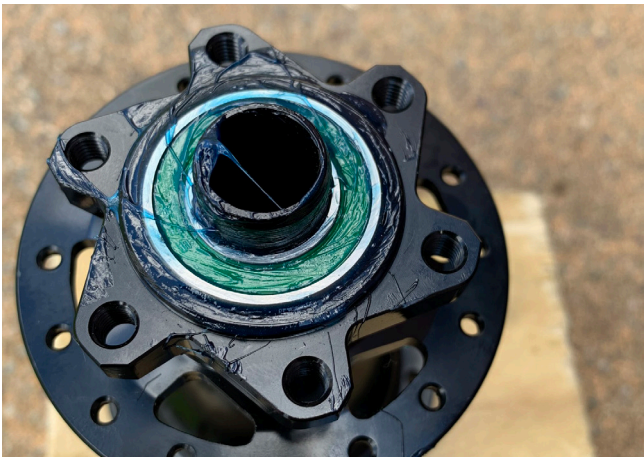
16. Apply grease to the non-driveside bearing and set into place.