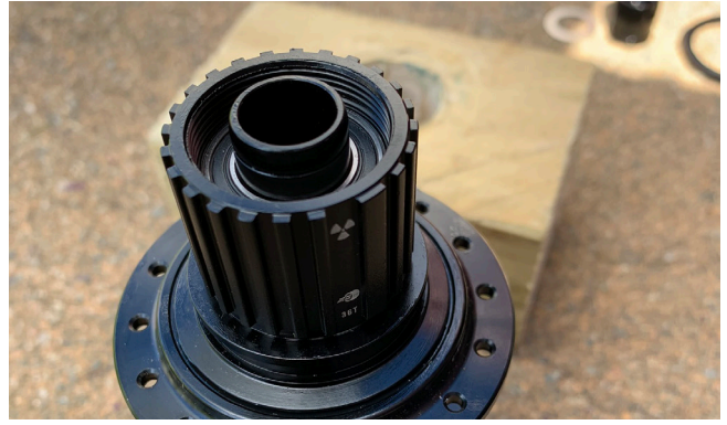
25. Push the freehub onto the hub – turn ANTICLOCKWISE as you push it on