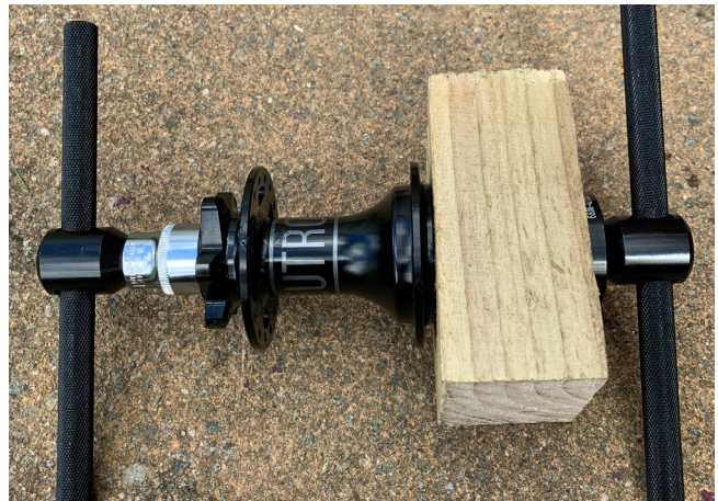
17. Press the non-driveside bearing back into place in the hub. When the bearing has been pressed ensure the axle has no play and spins smoothly.