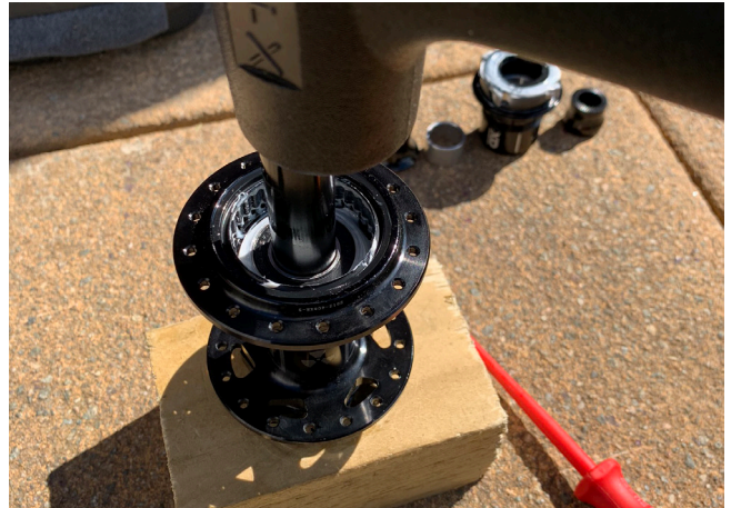
8. Carefully hit the end of the axle with the hammer to push the non-driveside bearing out.