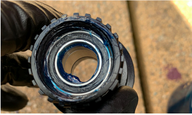
24. Apply grease to the driveside bearing on the freehub