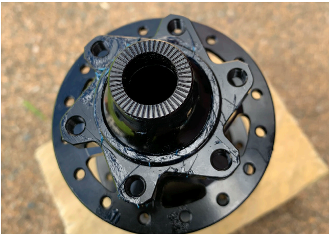
20. Refit the driveside end cap.