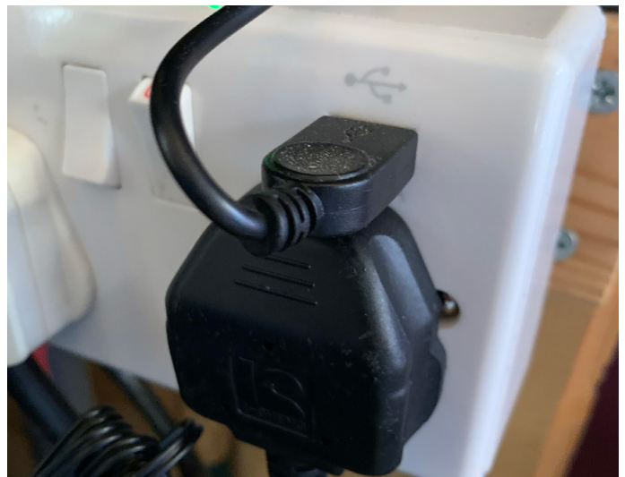
4. Plug the charger into a wall socket and switch on