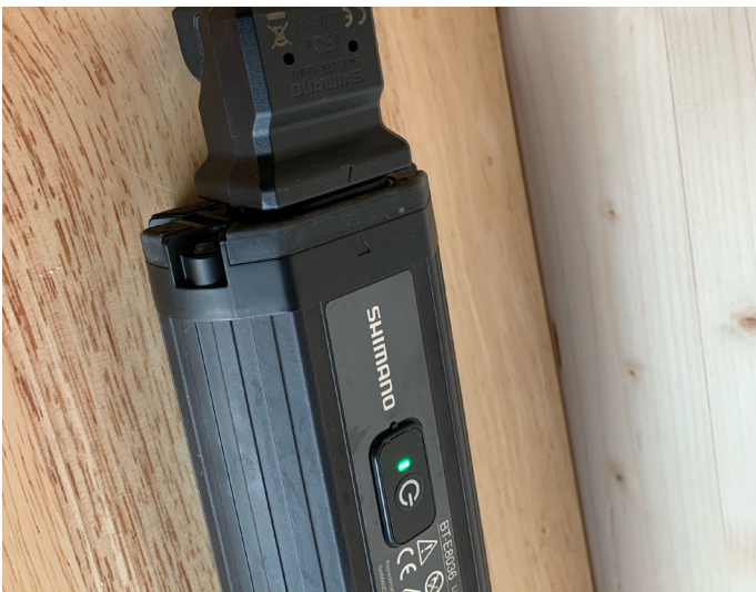
12. Ensure the light on the battery is illuminated

When the battery is fully charged, you can unplug everything then follow our separate how to guide to reinstall your battery