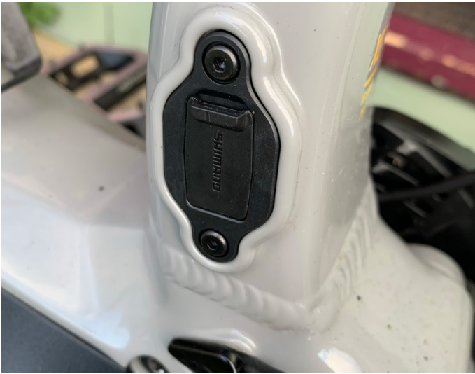
1. Locate the charging port on the nondriveside of the seat tube