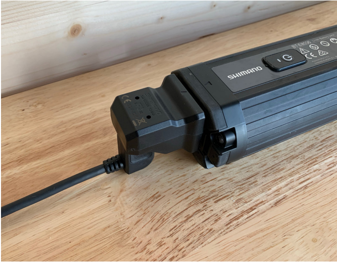
10. Connect the adapter & charge to the battery