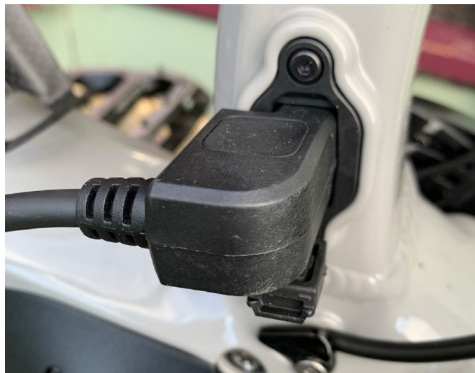
3. Insert your charger into the port