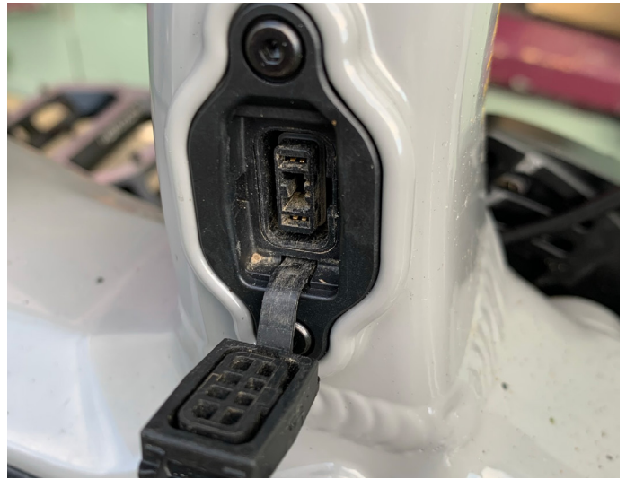
2. Pull open the cover door and check port is in good condition