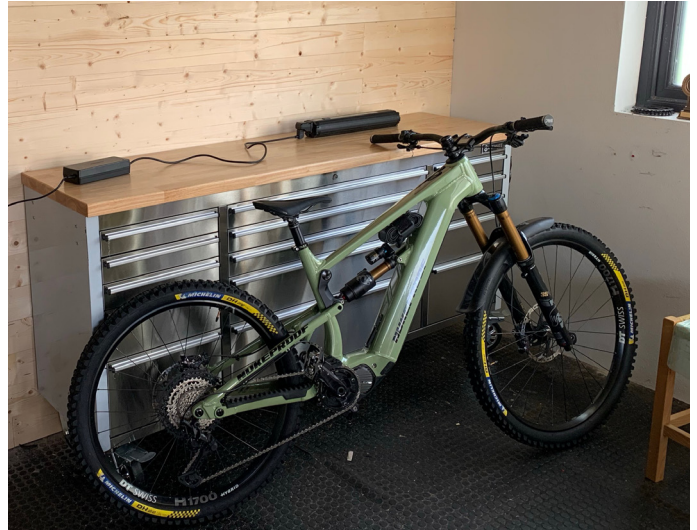
11. Connect the charger to a power socket and switch on