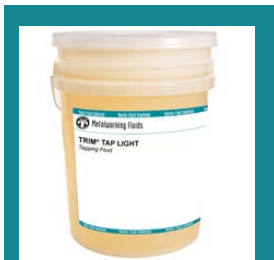
5-gallon pail SKU: TAPLT-5G UPC-12: 641238009184