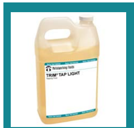
1-gallon jug SKU: TAPLT-1G UPC-12: 641238009139