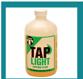
1-pint bottle SKU: TAPLT-1P UPC-12: 641238009221