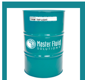
54-gallon drum SKU: TAPLT-54G UPC-12: 641238009191