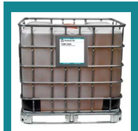
270-gallon tote SKU: E860-270G UPC-12: 641238081883