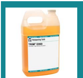
1-gallon jug SKU: E860-1G UPC-12: 641238081845