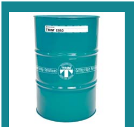
54-gallon drum SKU: E860-54G UPC-12: 641238081876