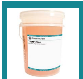
5-gallon pail SKU: E860-5G UPC-12: 641238081869