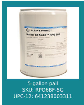
5-gallon pail SKU: RPO6BF-5G UPC-12: 641238003311