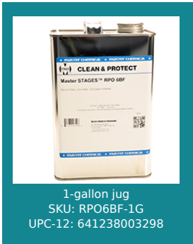
1-gallon jug SKU: RPO6BF-1G UPC-12: 641238003298