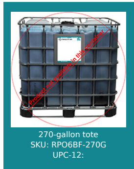
270-gallon tote SKU: RPO6BF-270G UPC-12: