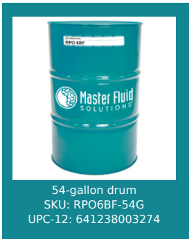
54-gallon drum SKU: RPO6BF-54G UPC-12: 641238003274