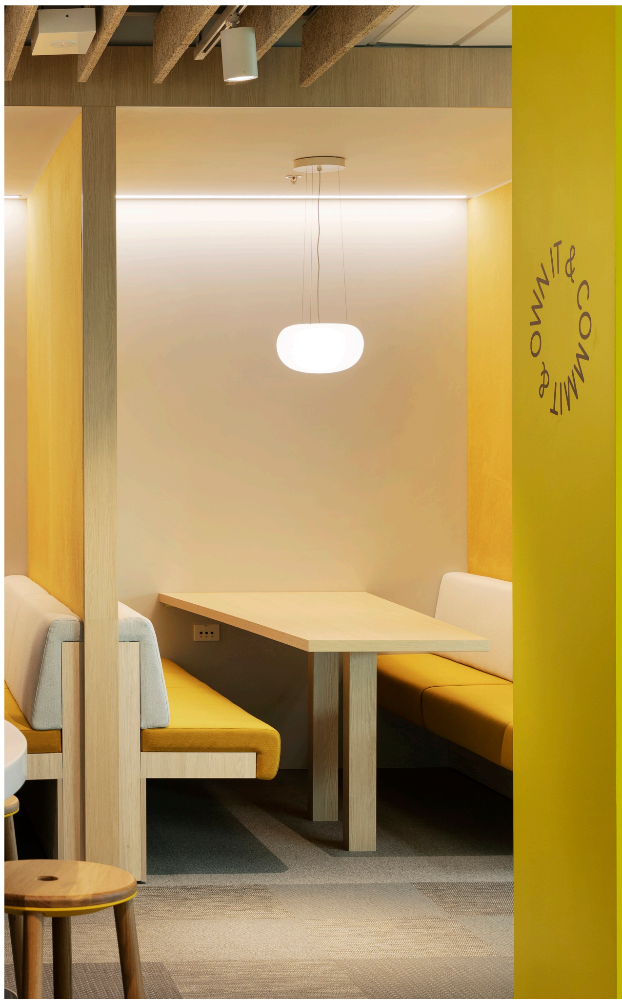
● Composition in Clay