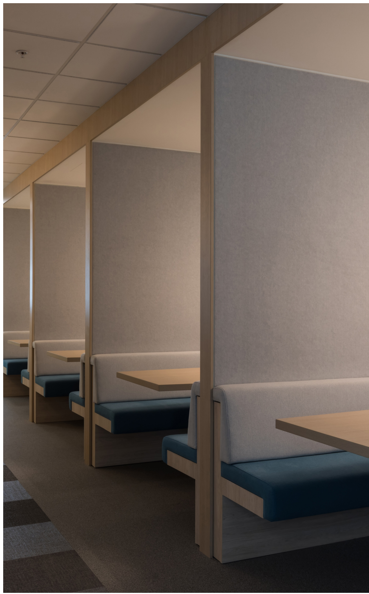
● Composition in Myst