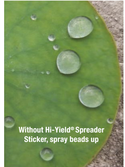
Without Hi-Yield® Spreader Sticker, spray beads up