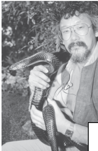
© David Suzuki: The Autobiography, 2006.

2. This is a _____ in an internment camp.