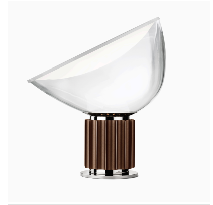
F6602046 Anodized Bronze