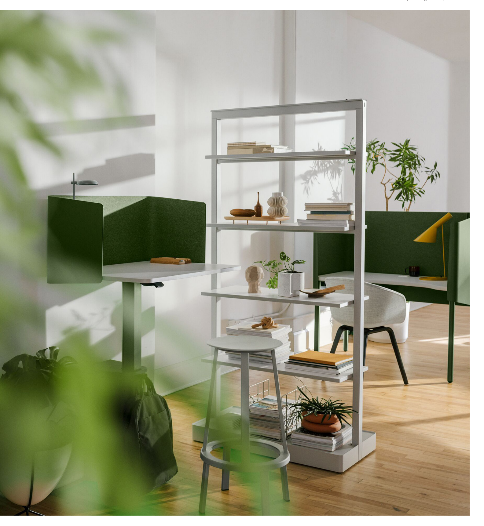
Find the Right Fit

We have options for every work environment—and every aesthetic. OE1's light, minimalist design comes in a wide variety of configurations and colors, helping organizations find their own perfect blend of purpose, performance, and expression.