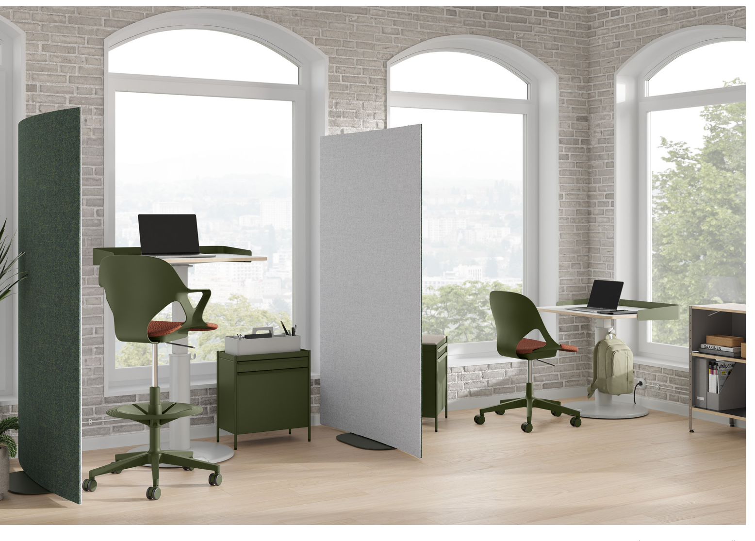
OE1 Curved Screen, OE1 Storage Trolley, OE1 Sit-to-Stand Table, OE1 Workbox