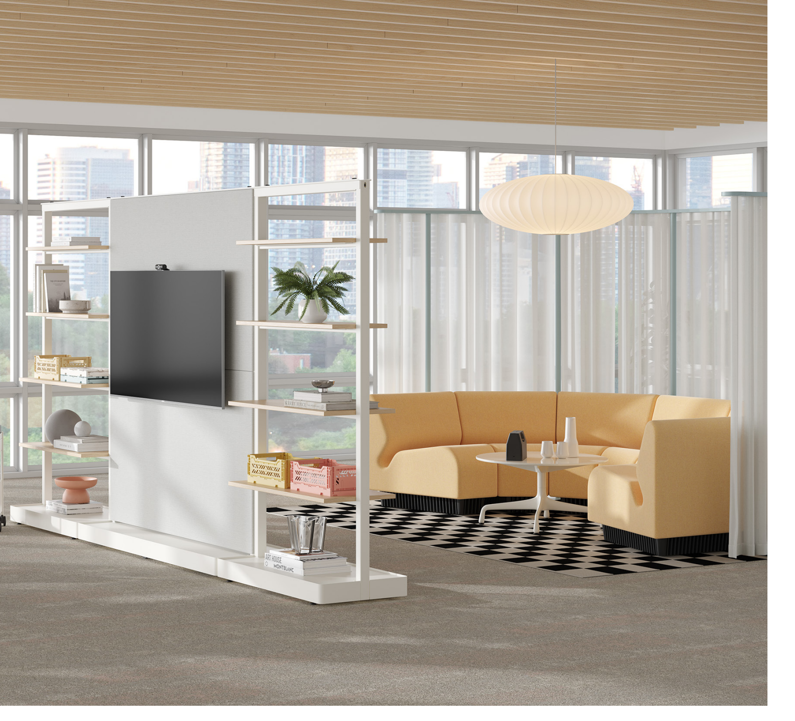
OE1 Agile Wall, OE1 Freestanding Curtain, OE1 Powerbox