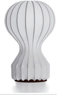
○ FU270109 White