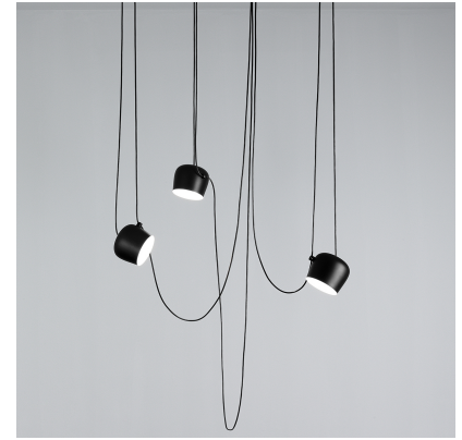
● FU009030BLS03 Black w Canopy