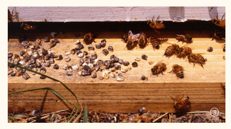
Mummified larvae at a hive entrance

Once the fungus has killed the larvae, it hardens them into a mummy-like appearance. In many cases, these mummified larvae can be found in the hive entrance or in the pest management tray. Dead larvae are also typically found in the brood nest.