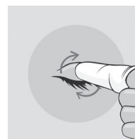
Figure 2: Cleansing your eyelids and eyelashes.

Gently massage with small circular movements, removing any crusts, secretions or make-up.