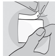
Figure 1: Opening the sachet.

Tear across the sachet to open (Figure 1) and unfold the wipe inside; do not use any tool to open the sachet.