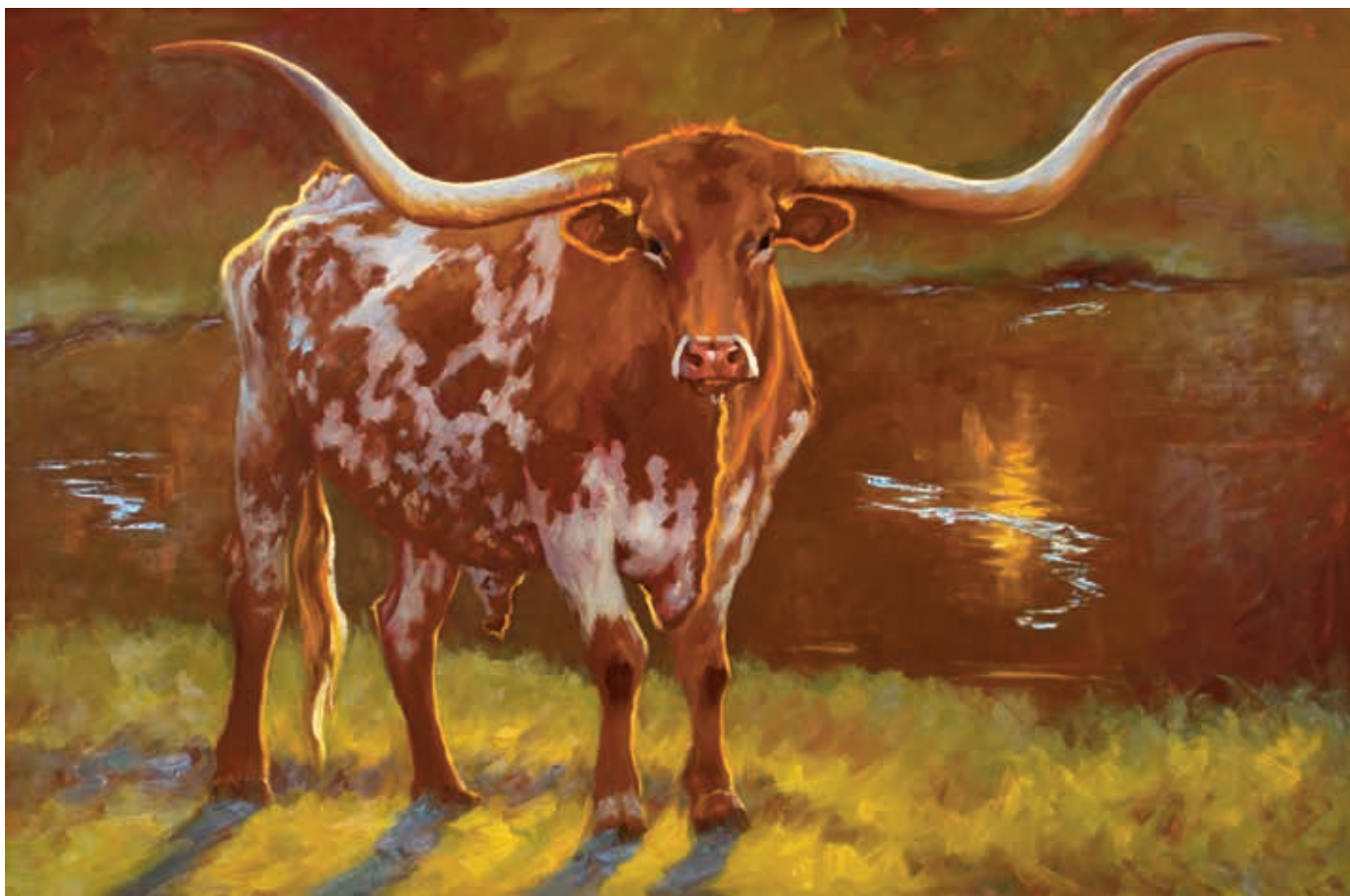
Late Evening Light , oil, 40 x 60"