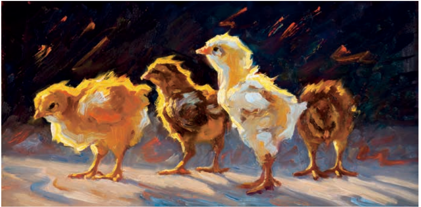
Blustery Day , oil, 6 x 12"