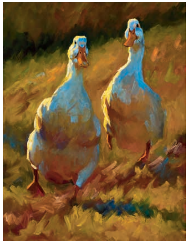
Duck Race , oil, 24 x 18"