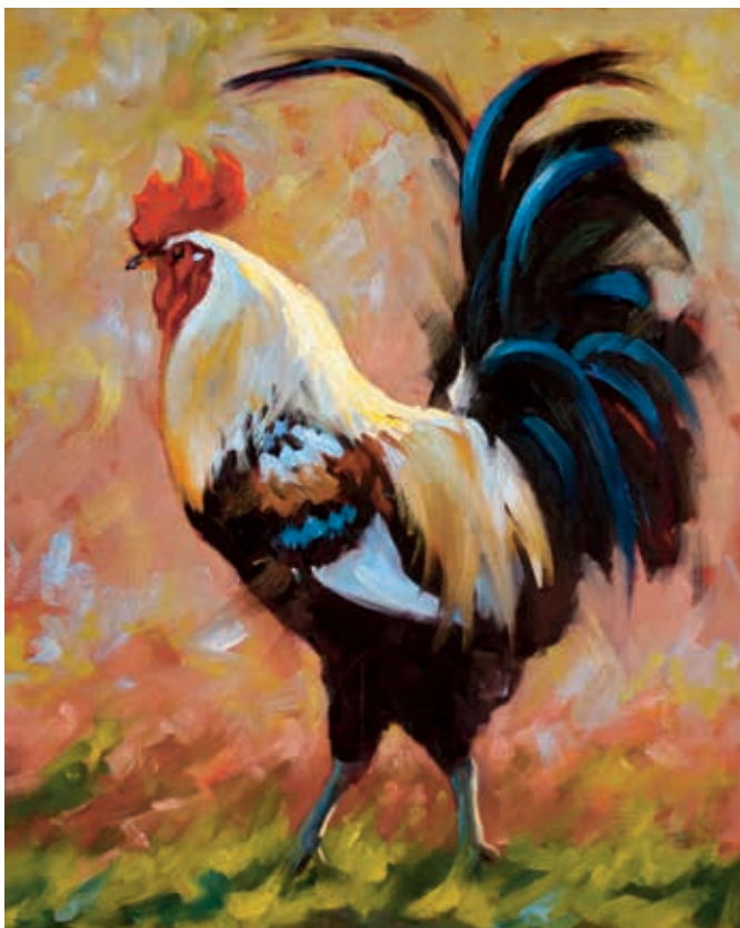
Lord of Luckenbach , oil, 20 x 16"