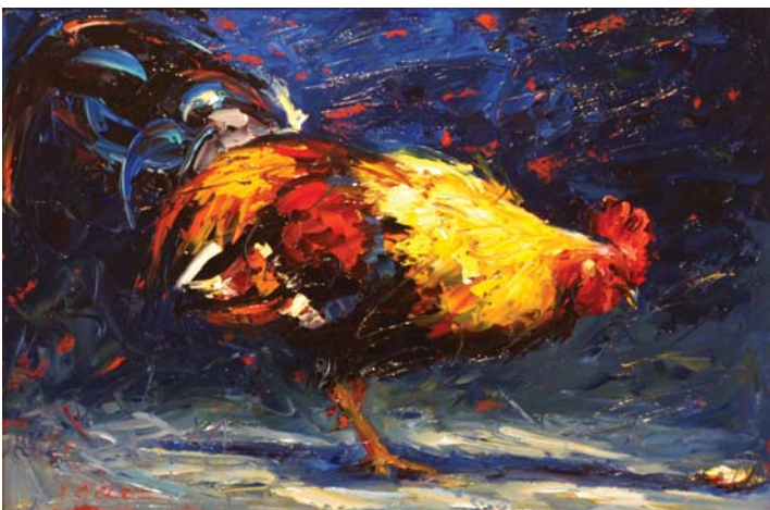
BLUE TOOTH, OIL ON PANEL, 16 X 24"