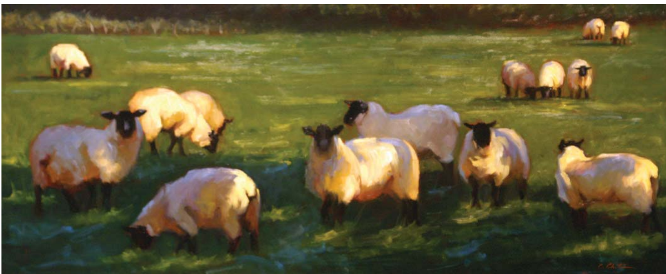
IDYLLIC PASTURES, OIL ON PANEL, 20 X 48"