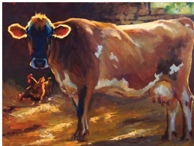
JERSEY GIRL, OIL ON PANEL, 36 X 48"