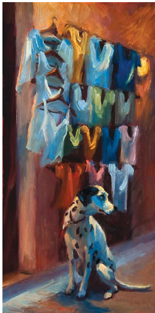
CHERI CHRISTENSEN, SHOP KEEPER, OIL ON BOARD, 12 X 6"