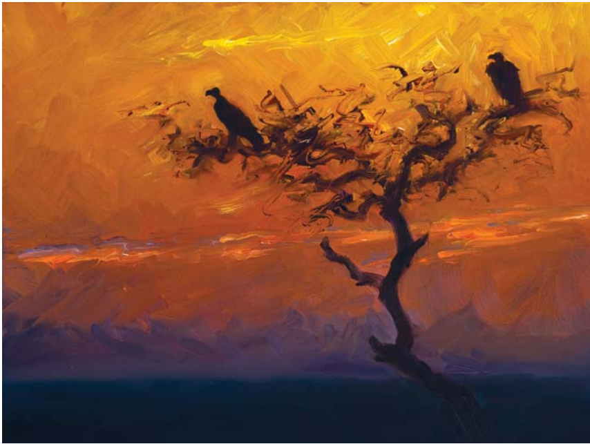
CHERI CHRISTENSEN, THE WATCHERS , OIL ON BOARD, 9 x 12"