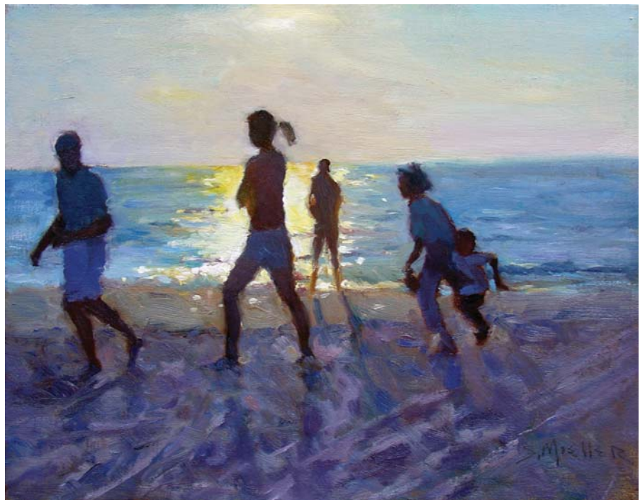
12 The Brigham Galleries, Sunset at Great Point , 11 x 14" by Stan Moeller

Cavalier Galleries, Inc. moved its main gallery to its present location at 405 Greenwich Avenue, Greenwich, Connecticut in 1994. In the spring of 2000, Cavalier Galleries opened a large gallery and sculpture garden in Nantucket, Massachusetts at 7 Salem Street. The Nantucket gallery expanded to a two-floor 5,500-square-foot space at 34 Main Street in January 2006.