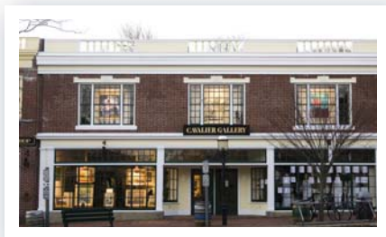
13 Cavalier Galleries in Nantucket