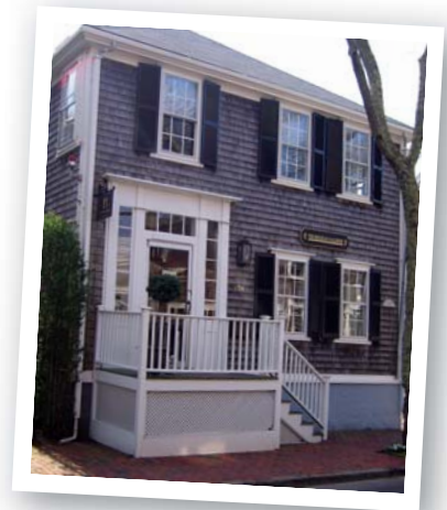
12 The Brigham Galleries in Nantucket

American paintings and works by a group of exquisitely and traditionally trained artists living in the U.S. and around the world. The gallery features an extensive roster of Portrait Artists,