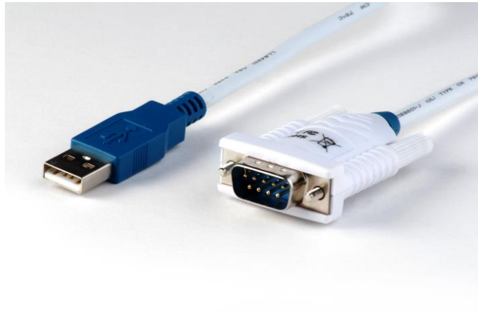
Figure 1-1 - UT232R -200-500

Each UT232R adapter contains a small internal electronic circuit board which utilises the FT232R, mounted inside a rugged plastic enclosure capable of withstanding industrial temperature ranges. The integrated electronics also include RS232 line drivers to provide true RS232 signal levels.