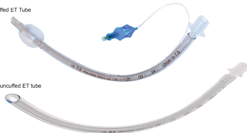
Standard uncuffed ET tube