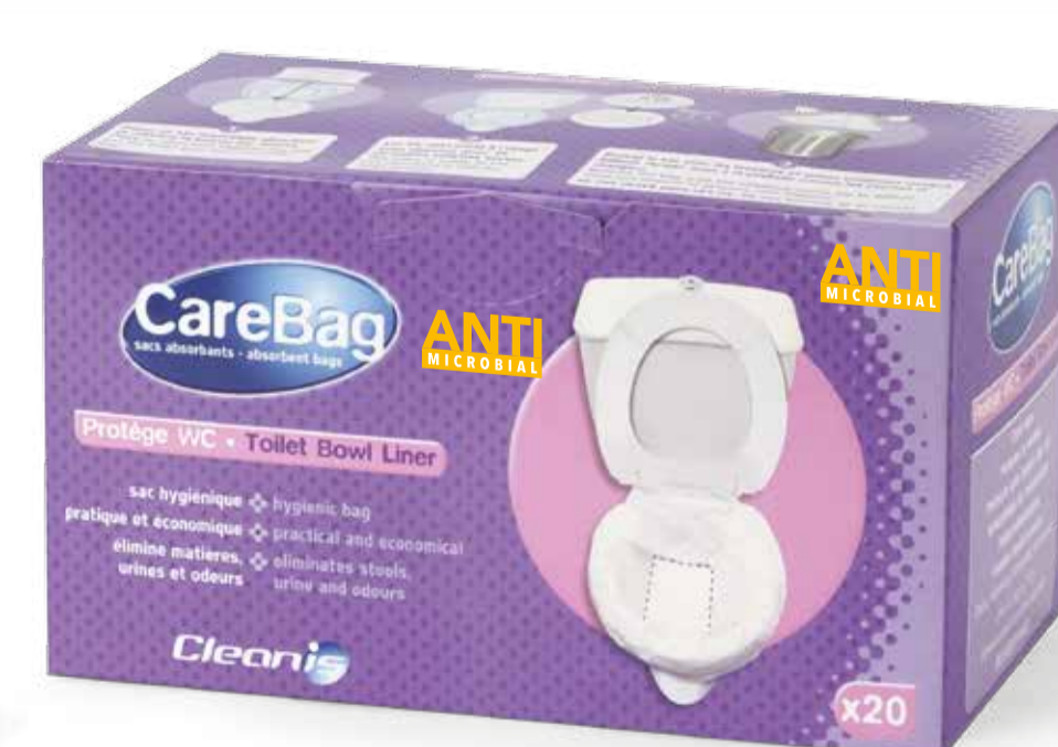
Toilet Bowl Liner

Cleanis AM26 additive owes its name to its antibacterial efficacy (compliant with ISO 22196: 2011), antifungal efficacy (compliant with ASTM E 2180-07) and efficacy on Clostridium difficile spores (according to ISO 22196 : 2011 standard). The additive is active on 25 pathogenic strains and C. difficile spores ( Aspergillus amstelodami , Aspergillus nidulans , Aspergillus niger , Candida albicans , Corynebacterium minutissimum , Corynebacterium spp , Enterobacter gergoviae , Escherichia coli , Escherichia coli 0157 H7, Klebsiella pneumoniae , Listeria monocytogenes , Mesophilic aerobes , Mucor racemosus , Myceliophthora thermophila , Penicillium chrysogenum , Proteus mirabilis , Proteus vulgaris , Pseudomonas aeruginosa , Pseudomonas cepacia , Pseudomonas putida , Saccharomyces cerevisiae , Salmonella enteritidis , Staphylococcus aureus , Methicillin-Resistant Staphylococcus aureus (MRSA) , Trichophyton mentagrophytes ).