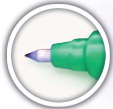
Extra Fine Tip

Select a marker, alone or in combination with a ruler and labels, and determine the appropriate product number from the list below when ordering.