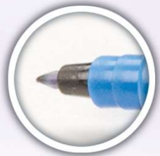
Fine Tip (Blue Marker Housing)