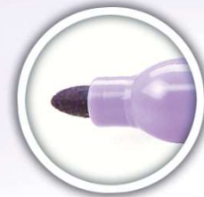
Sharpie Style Tip