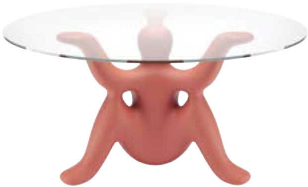
Table base in rotomolded painted polyethylene with three magnets screwed on supporting arms. Joining pads machined from solid stainless steel and UV bonded to the Ø140cm top in extraclear tempered glass.