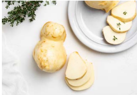
ORGANIC SMOKED MOZZARELLA Gourmet smoked mozzarella