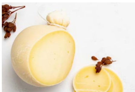
CACIOCAVALLO Traditional aged mozzarella