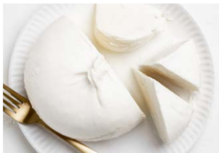
BUFFALO AVERSANA 1Kg Buffalo milk mozzarella