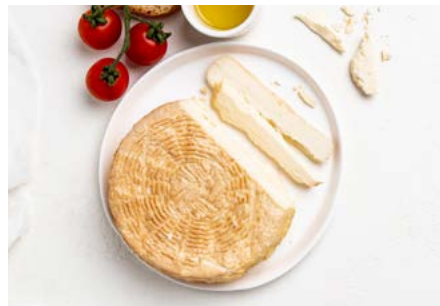
SMOKED RICOTTA SALATA Air dried salted ricotta, smoked