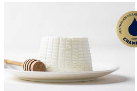
BUFFALO RICOTTA Traditional whey ricotta made from buffalo milk