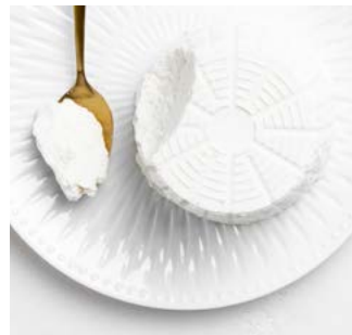
RICOTTA DELICATA Smooth and delicate whey ricotta