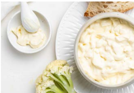
STRACCIATELLA Mozzarella strips in cream (burrata filling)