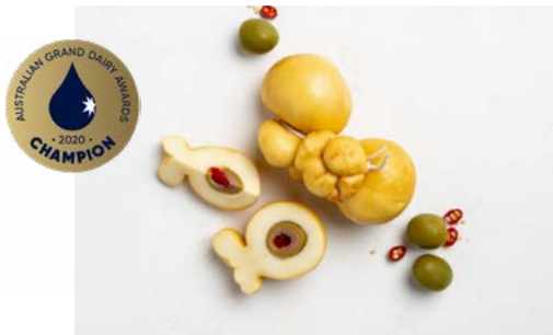
DIAVOLETTI Smoked provolone filled with olive and chili