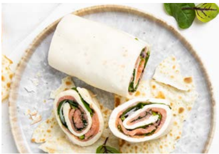
BOCCONCINI LEAF Flat mozzarella sheets, ready to be filled and rolled