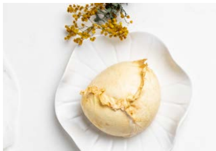
SMOKED BUFFALO MOZZARELLA 125g Beechwood smoked buffalo milk mozzarella