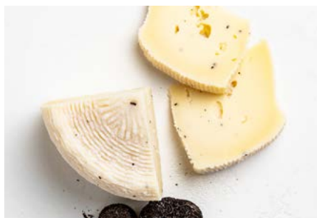
PANETTONE TRUFFLE Semi matured cow milk 'eye cheese' with black truffles