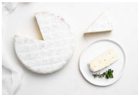
STELLA ALPINA Semi soft alpine-style mould ripened cheese