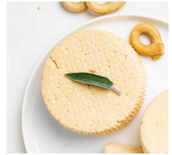
SMOKED CACIOTTA Fresh cow milk cheese, smoked