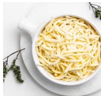
SHREDDED MOZZARELLA Shredded gourmet mozzarella