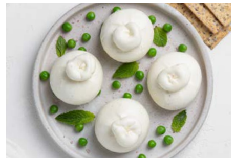
MINI BURRATA 60g Decadent mozzarella filled with stracciatella