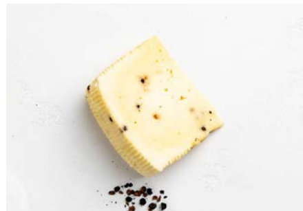
CACIO PEPPER Semi matured cow milk cheese with black peppercorns (pecorino style)