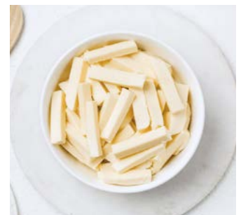
NAPOLI CUT Julienne style cut fresh mozzarella