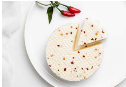
ORGANIC CACIOTTA WITH CHILLI Fresh cow milk cheese with chilli