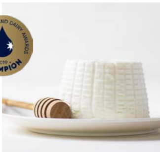
BUFFALO RICOTTA Traditional whey ricotta made from buffalo milk