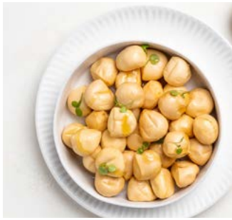
SMOKED BOCCONCINI 10g Bite sized smoked mozzarella