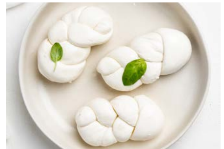
TRECCE 125g Hand braided mozzarella