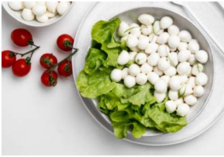
BABY BOCCONCINI 4g Petite sized mozzarella