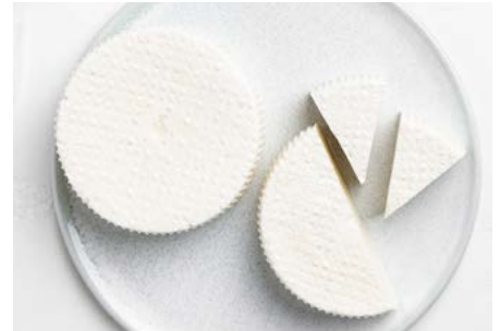
ORGANIC CACIOTTA Fresh cow milk cheese with a semi soft texture