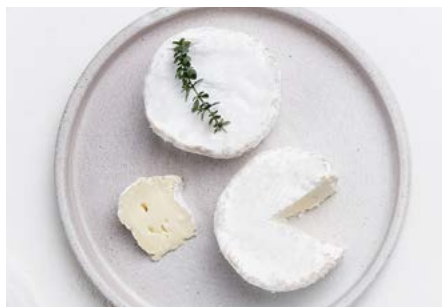
STELLA ALPINA MINI Semi soft alpine-style mould ripened cheese