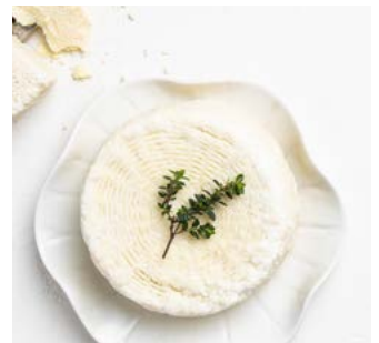
RICOTTA SALATA Air dried salted ricotta