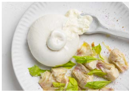
BURRATA 125g Decadent mozzarella filled with stracciatella