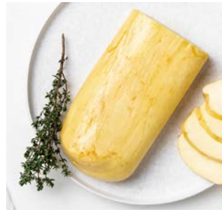
SCAMORZA AFFUMICATA Gourmet smoked mozzarella