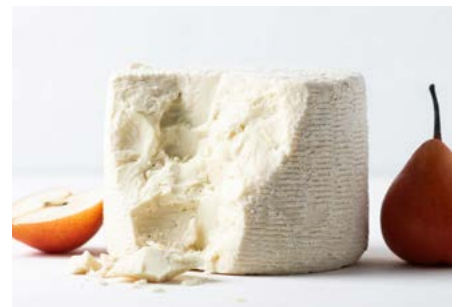
BUFFALOTTO 80% buffalo milk cheese, matured