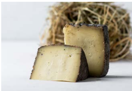
SECRETS OF THE FOREST 80% buffalo milk cheese with black truffles, matured in hay