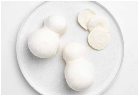
ORGANIC MOZZARELLA Gourmet mozzarella

We are now ORGANIC CERTIFIED! These products are made using only the highest quality organic ingredients and farm fresh milk from South Gippsland.