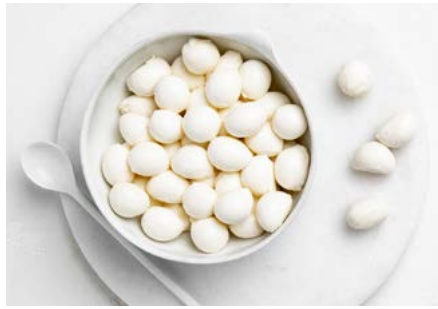
CHERRY BOCCONCINI 10g Cherry sized mozzarella