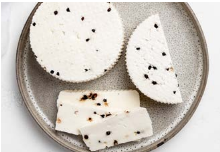
ORGANIC CACIOTTA WITH PEPPER Fresh cow milk cheese with black peppercorns