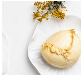
SMOKED BUFFALO MOZZARELLA 125g Beechwood smoked buffalo milk mozzarella