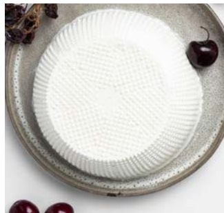
TRADITIONAL RICOTTA Traditional whey ricotta with a soft texture