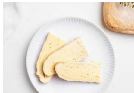
LAVATO Washed rind cow milk cheese (Taleggio style)