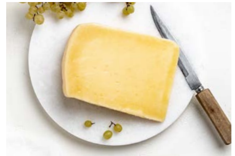
NABUCCO Semi matured cow milk cheese