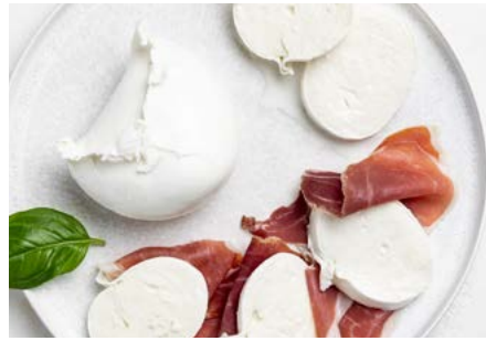
BUFFALO MOZZARELLA 125g Plump ball of buffalo milk mozzarella