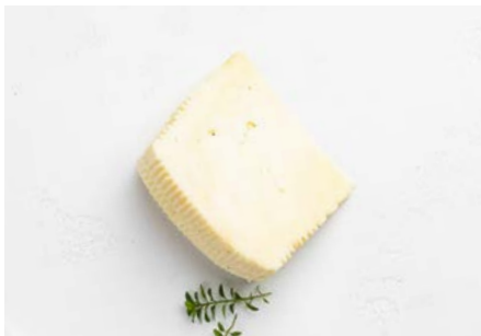
CACIO Cow milk cheese (pecorino style)