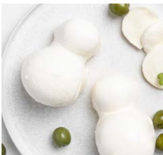
SCAMORZA BIANCA Gourmet mozzarella