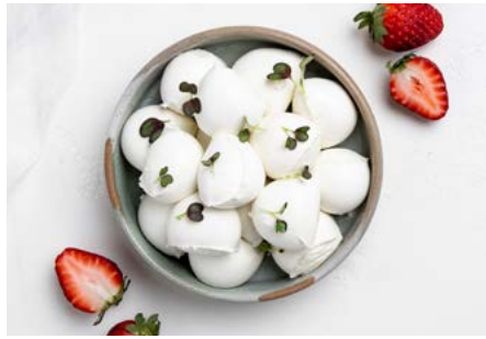
BUFFALO BOCCONCINI 25g Bite size buffalo milk mozzarella