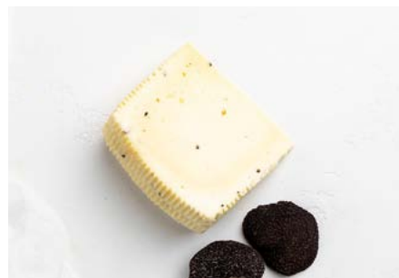
CACIO TRUFFLE Cow milk cheese with black truffles (pecorino style)