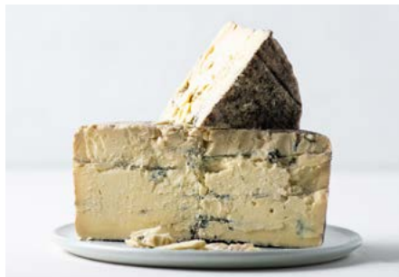
ISOLATION BLUE Matured blue vein cheese