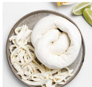
MEXICAN CHEESE String-type mozzarella (OAXACA)