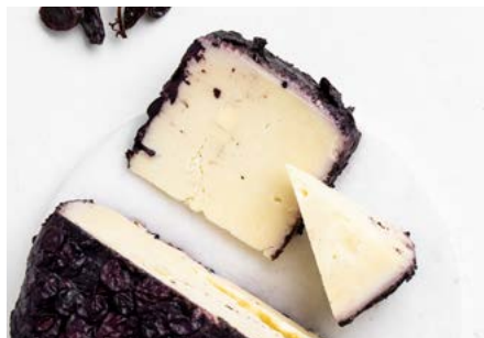
DRUNKEN BUFFALO 80% buffalo milk cheese, matured in Nebbiolo grape skins and must