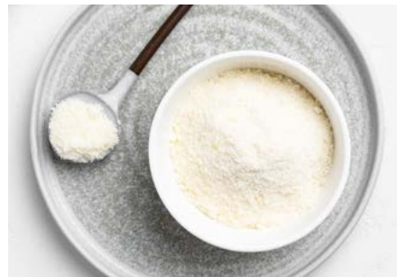
GRATED PARMESAN Finely grated parmesan cheese