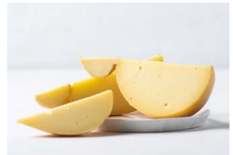
SMOKED CACIOCAVALLO Aged smoked mozzarella