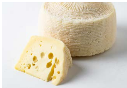
PANETTONE Semi matured cow milk 'eye cheese'