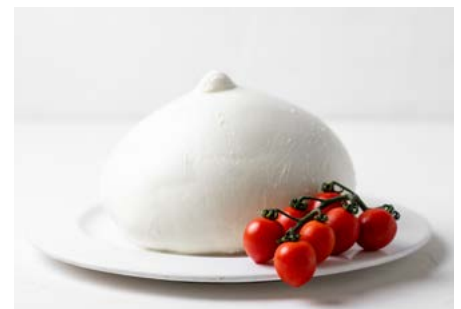
BUFFALO ZIZZONA 3Kg approx Buffalo milk mozzarella