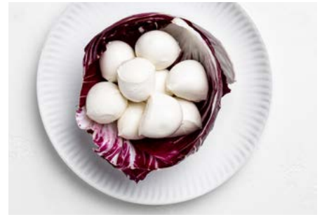
BOCCONCINI 25g Bite sized mozzarella