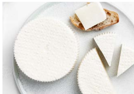
BUFFALO CACIOTTA Fresh buffalo milk cheese with a semi soft texture