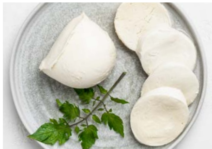
FIOR DI LATTE 125g Plump fresh mozzarella