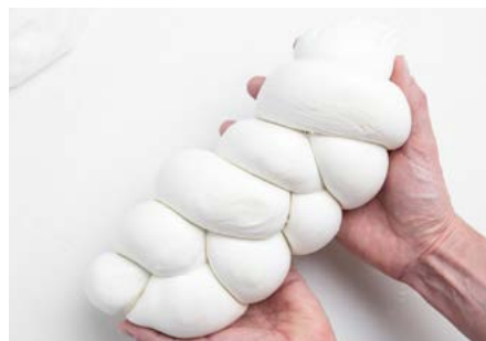
BUFFALO TRECCIA 1Kg or 2Kg Hand braided buffalo milk mozzarella