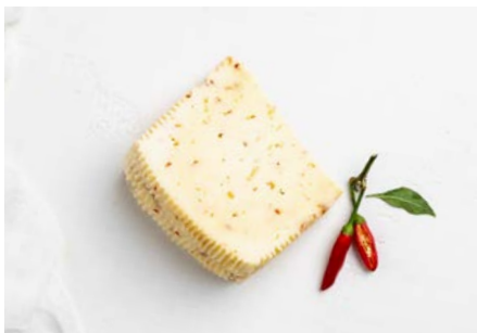
CACIO CHILLI Cow milk cheese with chilli (pecorino style)