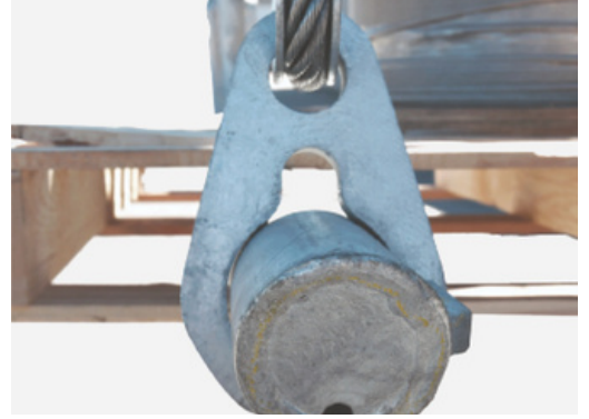
Easy Hook Up Secure locks hold in place