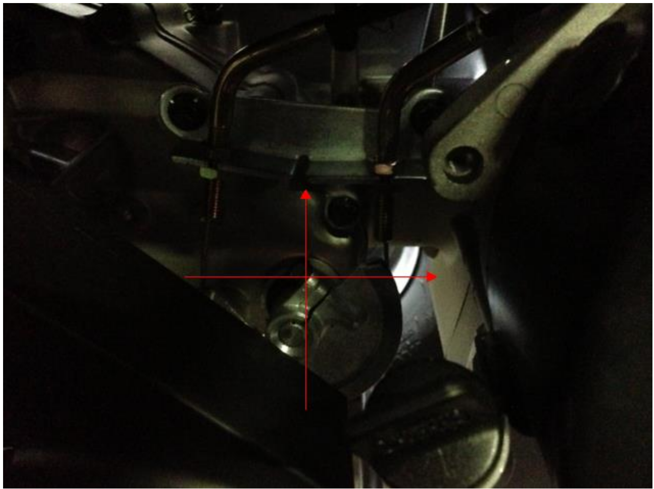
(by reverse "R" shifting)