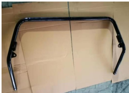
5、 Rear bar (R/L): 1 of each