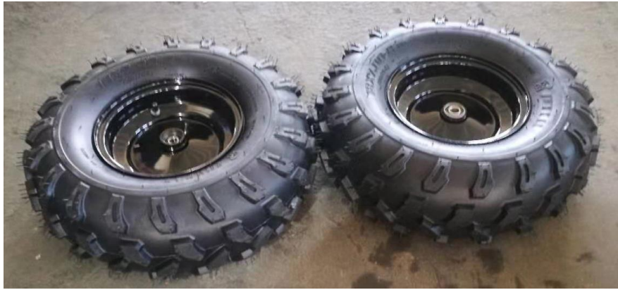
10、 Rear wheel assy. (R/L): 1 of each