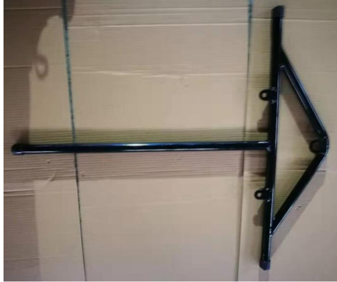
3、 Roll cage front (R/L): 2pc