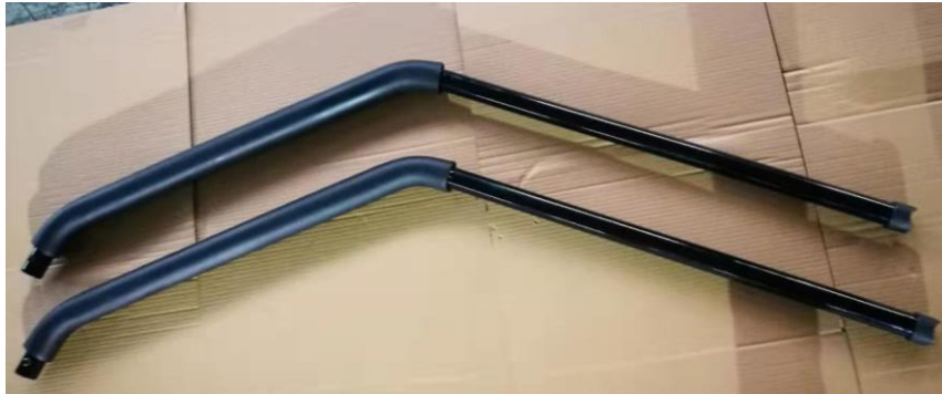
4、 Roll cage rear: 1pc