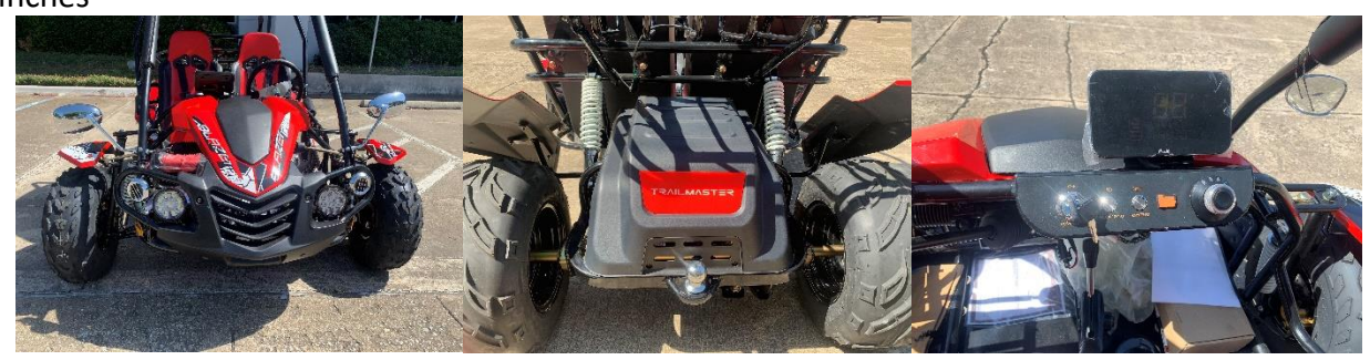
We have this model in red, blue

Key features include, Powered by 60V, 30Ah Lithium-ion battery, Digital LED monitor Fully automatic with reverse, Driver has to hit brake in order to engage throttle pedal for safety Offers two driving mode: with "D" mode top speed at 15M/h; with "S" mode top speed up to 33M/h, Strong low-end torque and able to climb 20 degrees' slope, Driving range up to 40 miles depending on weight, speed and driving conditions, Canopy top, 5-Point safety harness seatbelt, LED headlight; Horn, All-wheel fenders, Big tires: F / R: 20x7-8 / 22x10-10, Adjustable steering wheel, Hydraulic disc brake, Padding over roll cage, Individual sporting seats, Large rear utility rack, Trailer hitch, Adjustable driver seat: pedal to seat back adjustable from 36 to 43 inches