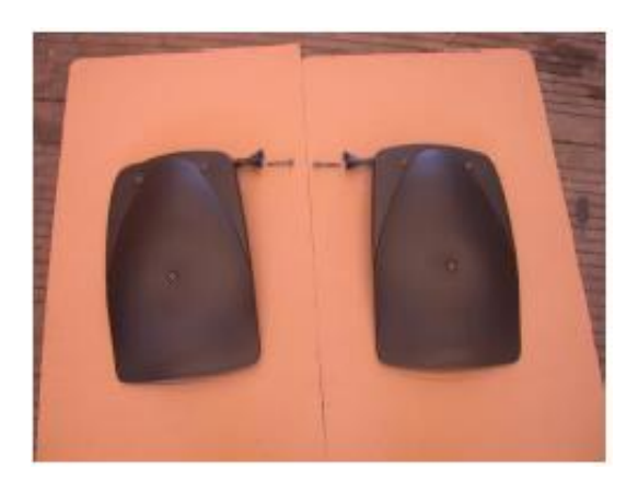
Pic. 2 1.3 One set of rear fenders for left and right, two bolts M8x45 screwed in the