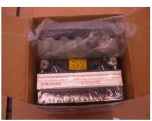
Pic. 1 1.2 One set of front fenders for left and right (pic. 2)