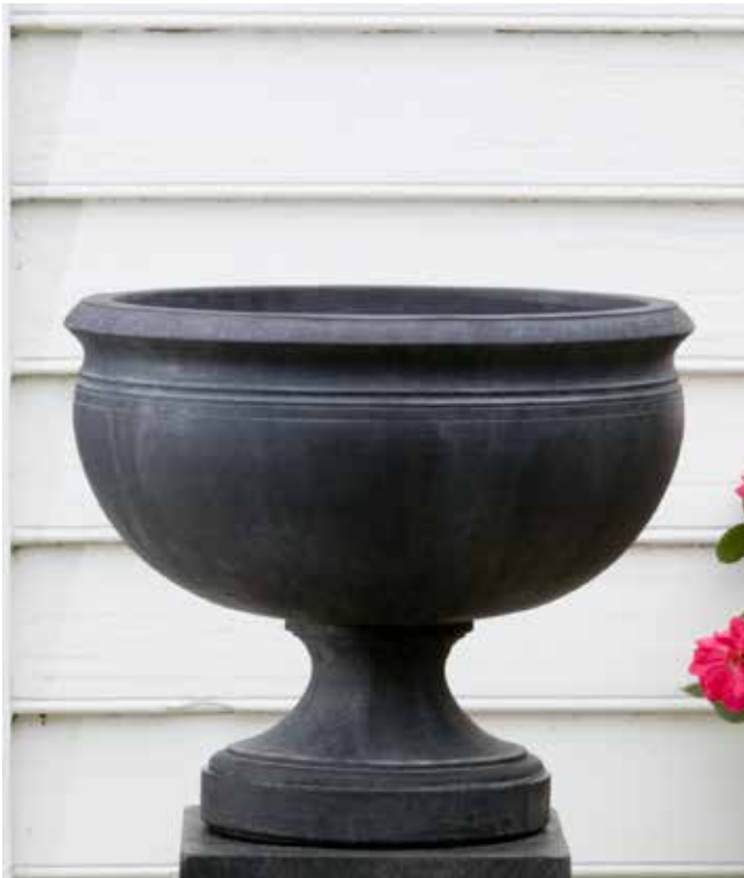
Shown in Nero Nuovo