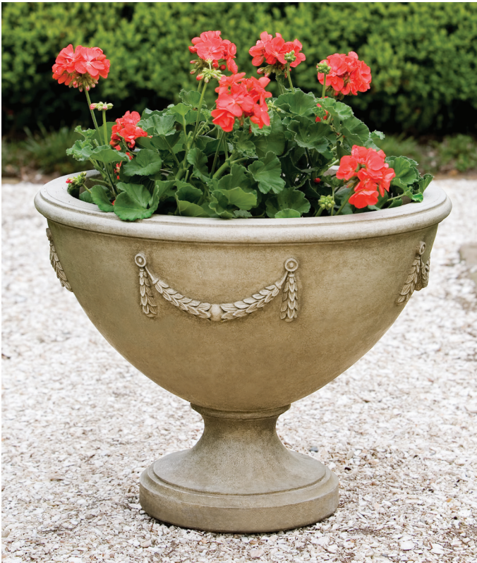
Shown in Verde