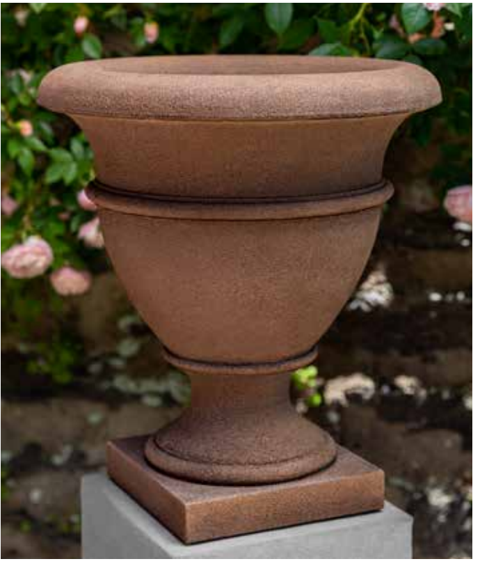
Shown in Brownstone