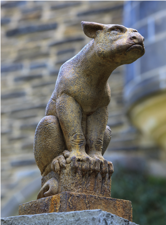
Shown in Pietra Nuova