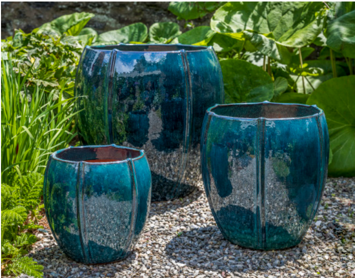
Shown in Indigo Rain